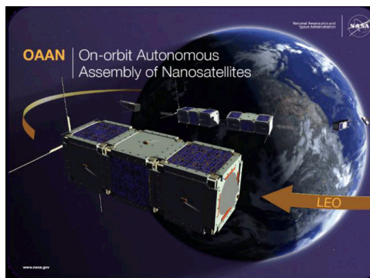
Early Artist's Concept

Autonomous docking of small satellites is the first step in enabling new and