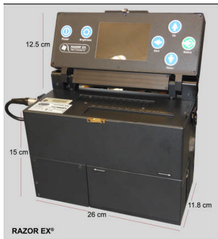
Figure 2. RAZOR EX PCR instrument (BioFire Defense, Salt Lake City, UT)

determine the total heterotrophic count of microorganisms to provide cellular enumeration data. Ultimately, this combined data would be presented to down-select a COTS platform suitable for microbial monitoring aboard ISS. Once the above goals were completed, the RAZOR was then applied to additional programs (i.e. Food Safety) for its functionality.