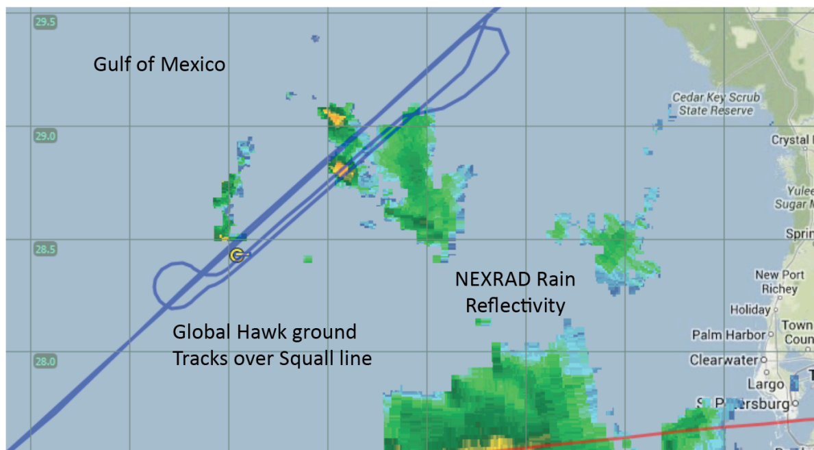
Fig. 1 HIRAD overpass of an intense tropical squall line in the Gulf of Mexico near Tampa, FL with an overlay of one simultaneous rain reflectivity (dBZ) image taken by the Tampa NEXRAD. Over a 40 minute time period, HIRAD obtained three high-resolution rain images.

This paper describes the HIRAD instrument, which 1D synthetic-aperture thinned array radiometer (STAR) developed by NASA Marshall Space Flight Center [2]. The rain rate retrieval algorithm, developed by Amarin et al. [3], is based on the maximum likelihood estimation (MLE) technique, which compares the observed T_b 's at the HIRAD operating frequencies of 4, 5, 6 and 6.6 GHz with corresponding theoretical T_b values from a forward radiative transfer model (RTM). The optimum solution is the integrated rain rate that minimizes the difference between RTM and observed values. Because the excess T_b from rain comes from the direct upwelling and the indirect reflected downwelling paths through the atmosphere, there are several assumptions made for the 2D rain distribution in the antenna incident plane (cross-track to flight direction). The opportunity to knowing 2D rain surface truth from NEXRAD at two different altitudes will enable a comprehensive evaluation to be preformed and reported in this paper.