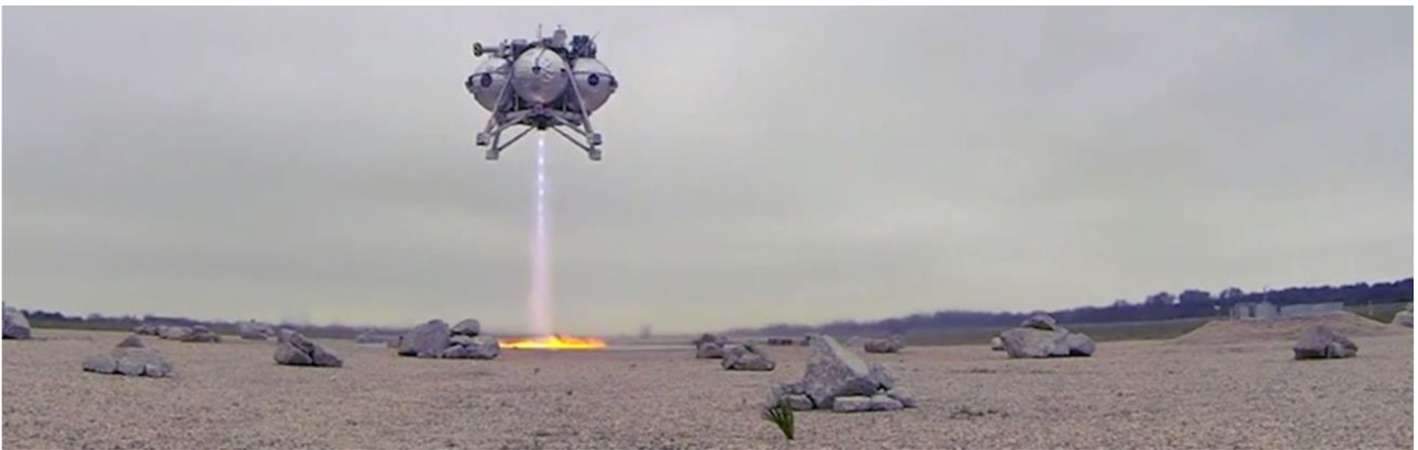
FIG 5 – Regolith-based pad under tests during Morpheus Vertical Take Off Vertical Landing (VTVL)