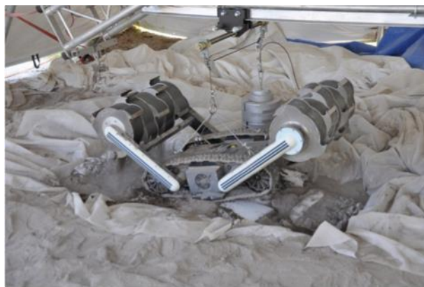
FIG 2 – Regolith Advanced Surface Systems Operational Robot (RASSOR) with Gravity Offload System.