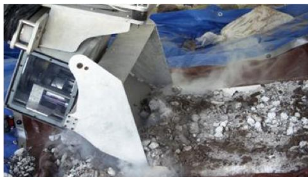
FIG 3 – Vibratory Impacting Percussive Excavator for Regolith (VIPER) Testing in Icy Regolith Simulant