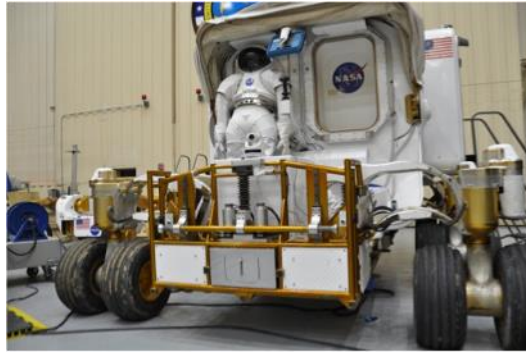
FIG 4 – Quick attach mount in front of multi-purpose surface transport during tests at Desert Rats.