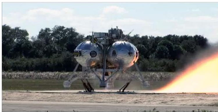
FIG 6 – Regolith-based pad with trench under tests during Morpheus vertical take-off at NASA Kennedy Space Center.