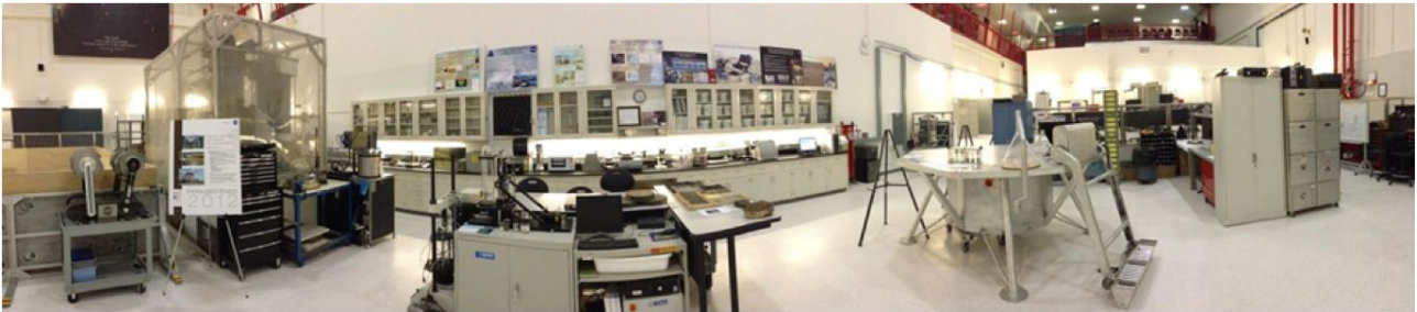
FIG 1 – The Swamp Works High Bay space for rapid research and development of planetary surface systems at Kennedy Space Center, FL (USA)

Note: only high quality, high resolution images are acceptable. Original graphics files (tifs, jpgs, etc) are preferred.