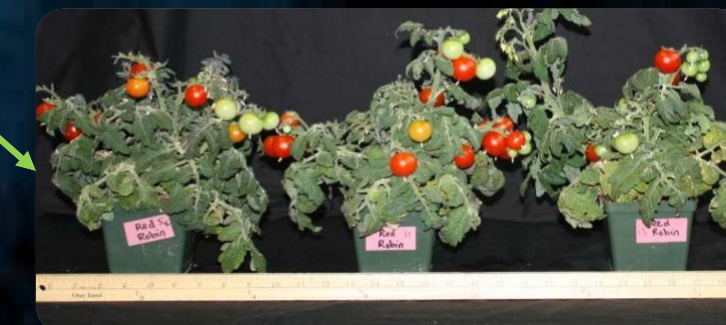
'Red Robin' tomato

Flight testing of top leafy candidate in Veggie as VEG-03 validation test to fly on Sx-8