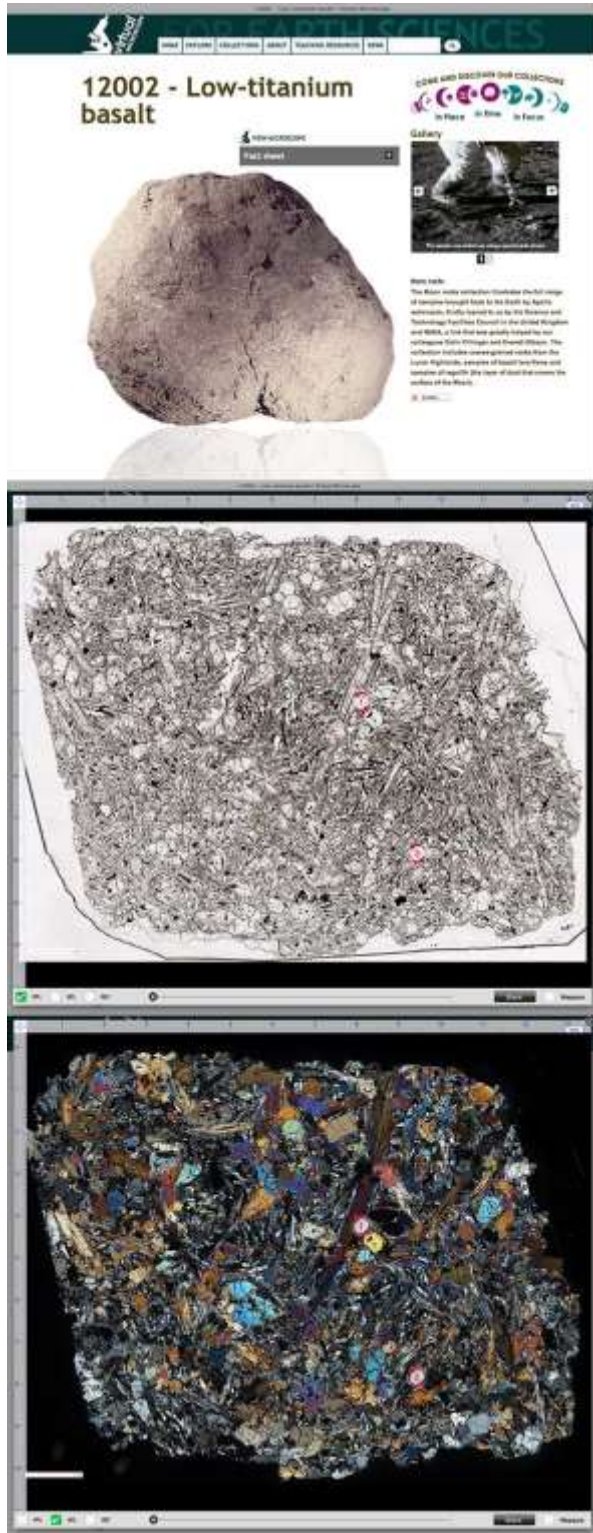
Figure 2 Screen shots from the Apollo12 virtual microscope.

entitled “Moon Rocks: an introduction to the Geology of the Moon” free from the Apple Bookstore [1].