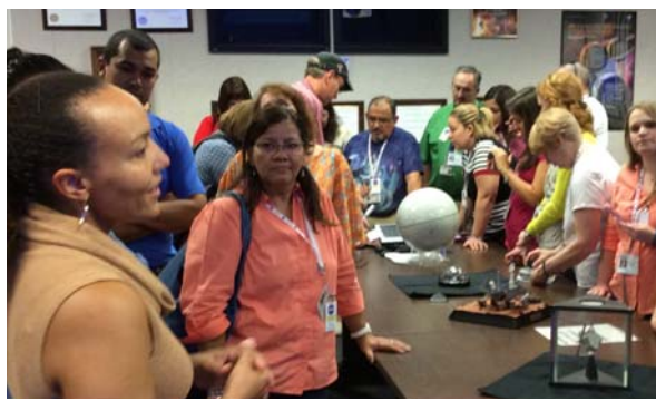
Image 2. Sharing STEM experts and ARES assets with educators.

Educator Workshops: ARES Science Engagement staff have led and also partnered with other organizations facilitating educator workshops that highlight our astromaterial collections. ARES houses and manages the distribution of the NASA lunar and meteorite sample disks, which enables teachers to be certified to borrow these invaluable resources to share with students. Training educators with inquiry based curricular materials as part of their certification requirements, along with connecting them with STEM experts and when possible, our curatorial facilities and other assets, enables an even more powerful experience. This exposure to our unique facilities and assets helps stress the uniqueness and scientific value of NASA's astromaterial collections, NASA's lunar and meteorite sample disks, and the educational value of incorporating this rich science into the classroom.