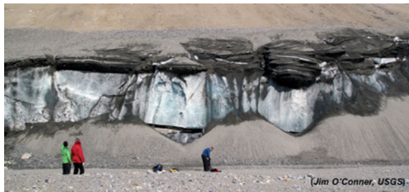
Figure. 1. Several meter-thick sedimentary layer preserving remnant ice from the last glacial maximum in Garwood Valley, Antarctica.

associated with the formation of the valley networks and earliest outflow channels, would have caused extensive erosion and carried substantial volumes of water and sediment to low elevations – especially in the northern plains. Finally, the intense volcanic activity that characterized this era could have readily blanketed any frozen remnant of an early ocean, outflow channel discharge, or ice-rich latitude dependent mantles, with volcanic ash and lavas – 10's to 100's of meters deep. This episodic resurfacing would have had a profound effect on the stability and preservation of ice at depth [7, 16]. For example, at mid-latitudes, a mantle of regolith <10 cm deep is sufficient to thermally isolate near-surface ice from daily temperature extremes, greatly reducing its sublimative loss. Mantles >1-2 m, provide enough insulation to protect ice from annual temperature extremes, allowing buried ice to survive for billions of years. Present-day examples of this effect include the defrosted regions of the SPLD and the ice-rich latitude dependent mantles. Numerous examples of the preservation of glacial ice, by its burial beneath mantles of sediment, volcanic ash and lava, can also be found on Earth (e.g., Fig. 1).