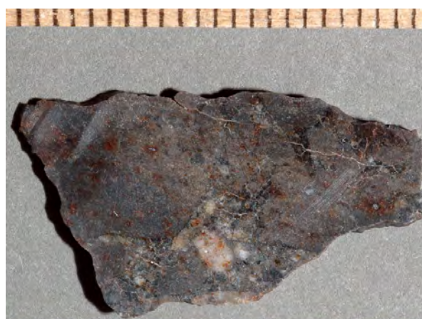
Figure 1. Slice of Dhofar 961 showing the predominant impact-melt lithology (1 mm tick marks; photo by Randy Korotev).

We irradiated the samples in the University of Oregon TRIGA reactor cadmium-lined core position for 375 hours to achieve a J-factor of ~0.1. K_2SO_4 and CaF_2 salts and a flux standard (Mmhb-1 hornblende and PP-20 hornblende) were simultaneously irradiated to correct for reactor-induced interferences and derive the neutron fluence. We encased each conducted step-heat experiments using a diode laser using Pt/Ir tubes or foils as microfurnaces. The sample or sample grains are encased in the tube or foil, and the sample placed in a fused silica planchet in the extraction line. The encasing Pt metal can then be heated very precisely and reproducibly, enabling the data to be used in Arrhenius plots to recover detailed diffusion domain