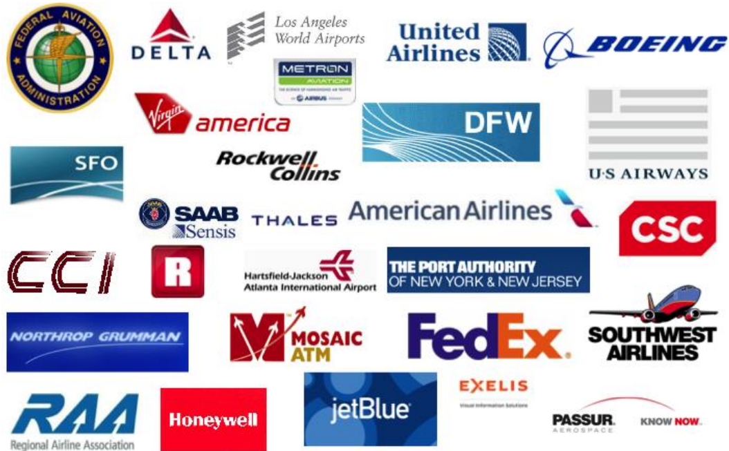
Figure 3. Stakeholders surveyed.

The primary goal of the survey was to uncover all the key issues faced by stakeholders in IADS operations – thus, emphasis was placed on the breadth of understanding of the issues as opposed to depth on specific operational issues. Also, an understanding of the economic and operational impact of any issue to a stakeholder was critical, therefore, particular emphasis was placed on identifying sources with knowledge of operational and business/financial aspects of their companies or organizations. Figure 3 shows the companies and organizations that provided information for the stakeholder survey. They included major US commercial passenger and cargo carriers; airport authorities of major US airports; groups within the FAA with responsibility for surface and terminal operations, operational infrastructure planning, and NextGen implementation; and industry providers of aircraft, avionics, and software/hardware tools that support airport surface and terminal area traffic management.