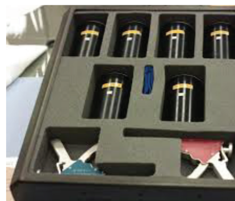
Fig. 3 BRIC-60 Canisters as flown in an ISS stowage locker.