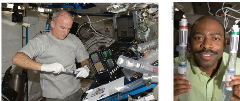
Fig. 1 Astronaut Jeff Williams using KFTs to fix plants on ISS (left) and Astronaut Leland Melvin holding two KFTs after harvesting and fixing Arabidopsis plants on ISS (right).

The KFT is composed of the following elements: a polycarbonate main tube where the fixative is loaded preflight, the sample tube where the plant or other biological specimens is placed during operations, the expansion plug , actuator , and base plug that provides fixative containment (Fig. 2). The main tube is pre-filled with 25 mL of fixative solution prior to flight. When actuated, the specimen contained within the sample tube is immersed with approximately 22 mL ( \pm 2 mL) of the fixative solution. The KFT has been demonstrated to maintain its containment at ambient temperatures, 4°C refrigeration and -100°C freezing conditions.