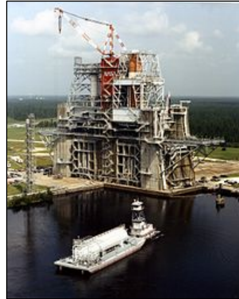
Figure 3 SSC B-Complex Test Facilities with propellant delivery barge in foreground