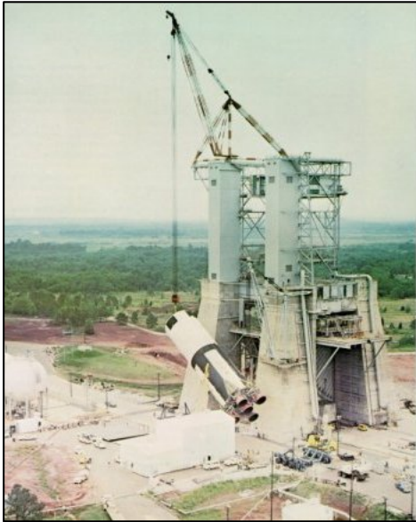
Figure 2 MSFC Saturn V Test Stand with Saturn V First Stage being lifted into place