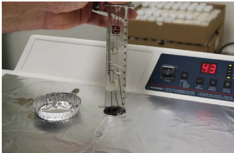
Figure 4 - O-rings suspended in solvent, ready for insertion into a heated water bath.

Three test specimens of each nonmetal, formed as O-rings or gaskets with a hole for hanging, were dried in a desiccator for 24 hours, weighed, measured for outer diameter in two directions, and immersed in boiling solvent within a high pressure borosilicate tube for 15 minutes. See figure 4. Elastomers were measured for hardness in accordance with ASTM D 2240 Standard Test Method for Rubber Property – Durometer Hardness Type A (Shore A durometer) at the point of maximum thickness prior to immersion. [15] One specimen of each material was weighed and retained as a control. The solvent was maintained at the boiling point using a constant temperature water bath. After immersion, the specimens were removed to the desiccator for 30 minutes and then weighed, measured, and inspected for evidence of deterioration. Specimens exhibiting a change in weight or linear swell of greater than 1% from the initial readings were returned to the desiccator for 24 hours and then re-measured. Specimens continuing to exhibit a change in weight or linear swell of greater than 1% from the initial readings were returned to the desiccator for an additional six days and then re-measured.