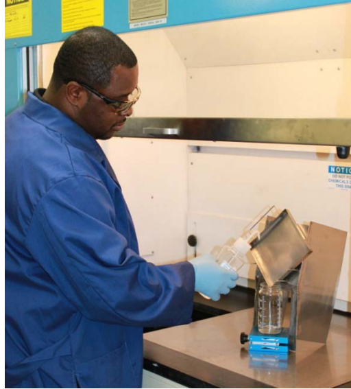
Figure 5 - Configuration to flush a test panel for the NVR removal efficiency test.

The NVR contaminants used to challenge the candidate solvents were: