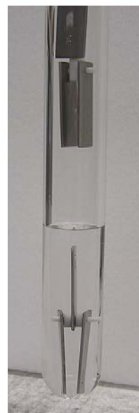
Figure 3 - Coupons immersed in solvent and suspended in the vapor zone.

Thirteen ferrous and non-ferrous alloys were tested: