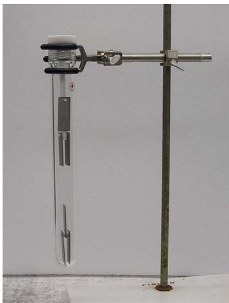
Figure 2 - Metal coupons suspended in a High Pressure Rated Glass Tube