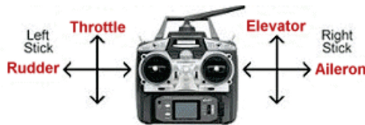
Figure 1. Typical sUAV manual controller. The sUAV operator directly controls the rudder, throttle, elevator, and aileron.

However, with operators becoming more of mission managers or team members with other autonomous agents, they no longer are concerned about actively maintaining the attitude of the sUAV. Instead, their primary concern is are what the vehicle is doing in