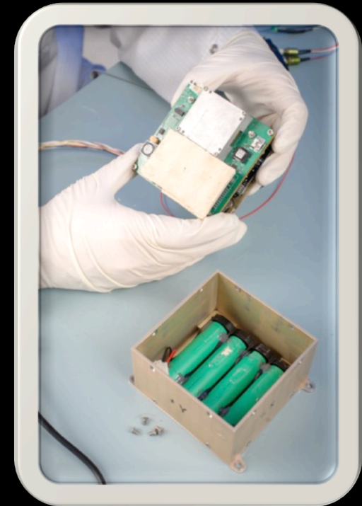
Self-contained and weighs 0.84 kg Batteries included!