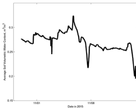
Figure 4. 0-5.7cm vertically integrated liquid soil moisture averaged for all of the sites measured with Stevens Hydra probes. The sudden drops are the result of soil freeze events.

Prior to the field campaign soil roughness (rms height and correlation length) was measured at two locations in each field. Measurements were made in the N-S and E-W look directions with 3-m profiles. Also, residue photos were taken at two locations in each field in an attempt to quantify the percent residue cover. Further, at 3 locations in each field residue samples were taken from a 0.5x0.5m area to estimate the dry biomass. Soil texture, bulk density and volumetric water content measurements were determined previously during the SMAPVEX12 field campaign [3,4]. This information was used to calibrate the handheld and in-situ Stevens Hydra probes using field specific calibration equations [4].