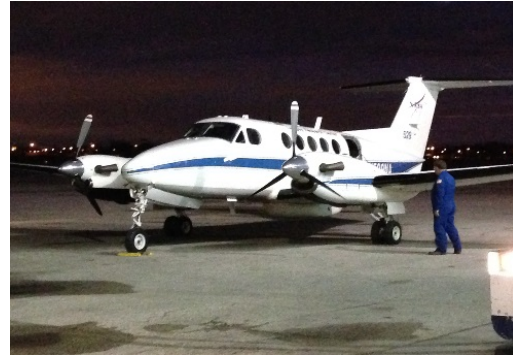
Figure 1. SLAP preparing for an early morning flight on a NASA Langley King Air

with ground-based radiometers plus forest locations. At the end of each flight, the instrument was flown over Lake Manitoba to obtain water calibration data for the scatterometer and radiometer.