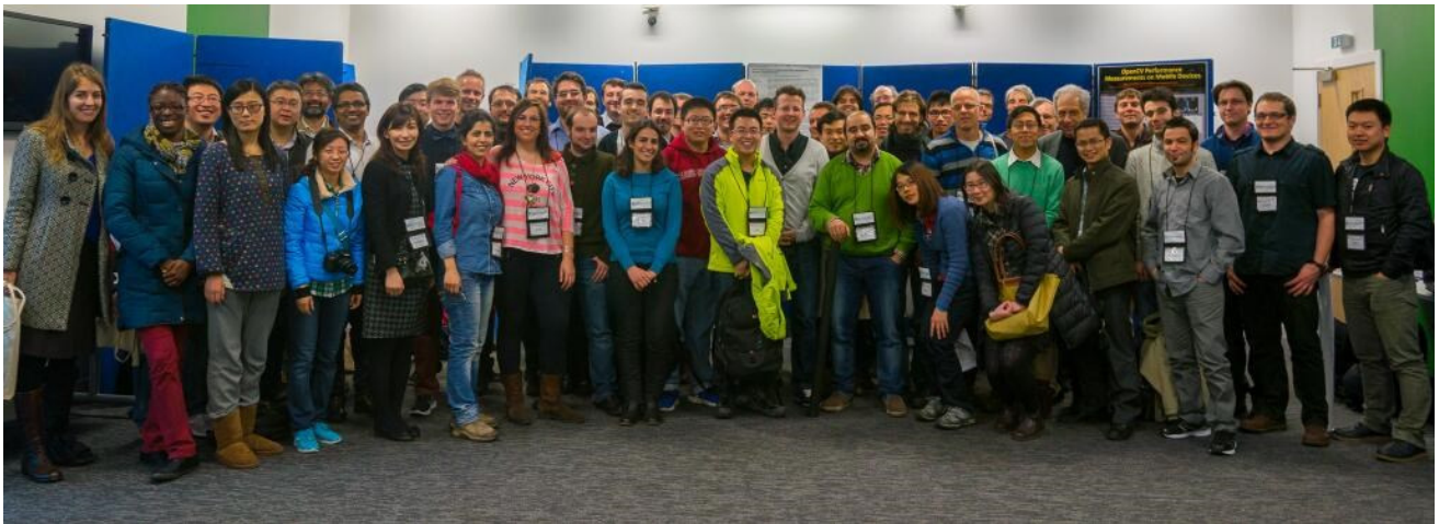
Figure 4: Poster and demonstration session from the last day of the conference

From the main technical program 4 papers were selected to be considered for the best paper award and these were presented in a best paper session. The nominated papers were: