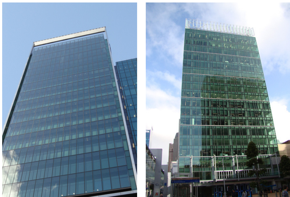
Figure 2. “Green” accredited Case study buildings.

The results of the monitoring revealed an extraordinary high use of blinds and lights throughout the day (Figure 3). The opening/closing of blinds hardly varied across the course of a day. This may be because of habit or because of a continuous problem of glare or overheating. However, there were gradual, yet significant changes across the seasons.