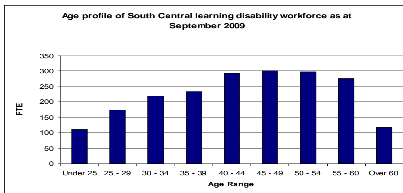
Figure 1 Current age profile of specialist learning disability workforce based on FTE

unreasonable to assume that one might expect either maintenance in the numbers of practitioners in this workforce, or a consequential increase. However, when data were analysed for this SHA a number of worrying trends appeared to surface. Figure 1 shows the current age profile of the learning disability specialist workforce (based on FTE) for NHS South Central. If a retirement age of 60 is assumed, then 5.9% of the workforce has currently reached retirement age, and a further 13.6% will reach retirement age within the next 5 years. In addition a significant number of this learning disability workforce may be eligible to retire at 55 in this case 19.5% of the current workforce has already reached retirement age.