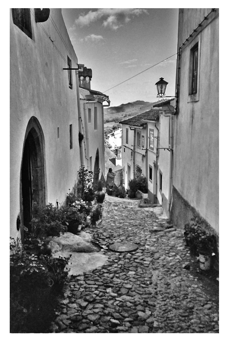
Figure 2. Medieval Jewish guarter, Castelo de Vide, Portugal

(Dekro 1988:11, quoted in Kugelmass 1992:405-406, 1996:202)