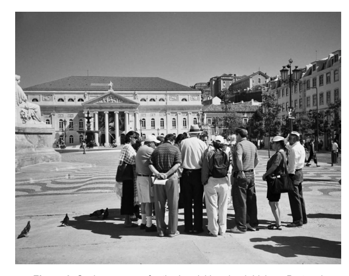
Figure 3. Saying a prayer for the Inquisition dead, Lisbon, Portugal

Do you ever wonder if the spirits of those who died burnt ... ever visit and stay with us? Perhaps on those days, when we prayed in Hebrew in their memory, perhaps they visited. Perhaps their souls were there. With us in harmony under the Portuguese beautiful blue skies. They were there to give us strength. They were there to tell us they are happy to be remembered after all these centuries.... Their descendants are coming back, finding out, returning. It was that trip that allowed us to come home.