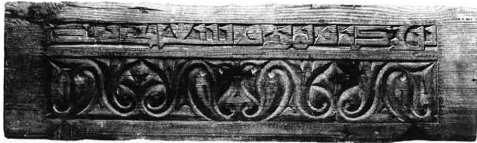
FIGURE 17.2 Wood panel with an inscription of best wishes to its owner. Egypt, Tulunid period, ninth century. Cairo, Museum of Islamic Art, no. 3498. Source: Hayward 1976: 282, no. 435. © Victoria and Albert Museum, London.

There is no single, obvious interpretation for such anonymity. Some metalwork and rock crystal items might be conceived of as individually commissioned gifts, possibly diplomatic. On the other hand, the many ceramic objects with generic blessings suggest, instead of a commission, a form of industrial production tied to retail outlets, and the same can be said for artifacts on which we have names stamped or painted, such as the ninth- to tenth-century Iraqi or Iranian stamped glass objects with the name Husayn M[uhammad], as on a bottle and fragments of stamps in the Corning Museum of Glass (inv. no. 59.1.571; and inv. nos. 59.1.516, 59.1.517, 59.1.518). Other examples are Fatimid, late tenth- or early eleventh-century luster painted objects, both ceramic and glass, with the name Sa'd (Contadini 1998: chapter 3, pls. 34b, 36a–c for ceramics and fig. 33 for a glass example). Whether interpreted as individual (Jenkins 1988) or brand names, they point to a particular source almost certainly producing for a well-to-do urban market.