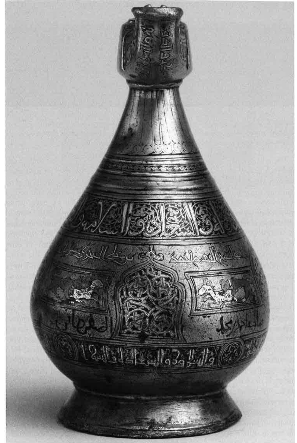
FIGURE 17.1 Silver-inlaid, pear-shaped, metal ewer with a lamp-shaped spout, with inscriptions including one identifying the owner as a “doctor in religious law.” Probably Khurasan, late twelfth century. New York, Metropolitan Museum of Art, inv. no. 54.64.

It is difficult to determine the social milieu of the many anonymous artifacts that have inscriptions of a generally benedictory nature, even if they are of equivalent (or in some cases even higher) quality to those known to have been made for princes. Inscriptions with the formula “blessing on the owner” ( baraka li-sahibih ), simple or expanded, are particularly common on metalwork, but they also appear on other media such as woodwork, as on a ninth-century Egyptian, Tulinid panel ( baraka wa-yumn wa-sa‘ada li-sa[h]ibih ) (Hayward Gallery 1976: 282, no. 435. Figure 17.2); ceramics, as on an early thirteenth-century Iranian vase (Fehérvári 2000: 124, no. 152); glass, as on a ninth–tenth-century cup from Egypt, Syria, or Iraq (Jenkins 1986: 20, no. 17); and rock crystal, as on a c. first half of the eleventh century Fatimid Egyptian fragmentary flask (Contadini 1998: 37, pl. 5).