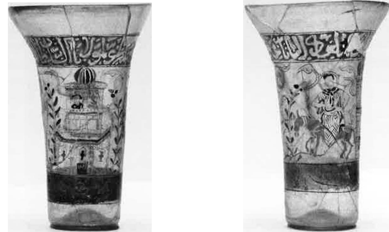
FIGURE 17.3 Two glass beakers with enameled and gilded painted decoration showing Christian scenes, possibly made for local Christian markets. Attributed to Syria, datable to the first half of the thirteenth century.

Also, inscriptions containing formulaic blessings for a sultan may be found on objects presumably not made for a sultan. This is the case, for example, with two gilded and enameled glass beakers now in Baltimore (Atıl 1981: 126–127; Carswell 1998, Figure 17.3), attributed to Syria, and datable to the first half of the thirteenth century. Both the naskh/thuluth script and the content, “glory to our lord the sultan, the royal, the diligent, the wise, etc.,” are often encountered on Ayyubid and Mamluk material from Syria and Egypt, but the iconographical themes and the style of clothing of the figures painted on the beakers clearly associate them with a Christian environment. In particular, we find stylized but easily recognizable representations of the Holy Sepulchre, a figure possibly of Christ riding a donkey, priests/monks, and at the same time city landmarks such as the Dome of the Rock and, as identified by Carswell (1998: 62), a minaret with parapet and dome on the north side of the Haram enclosure in Jerusalem. Fragments with similar iconography have been excavated at Hama (Riis 1957: 93, nos. 286–288), suggesting Syria as a production center. Because of the explicitly Christian connections of their iconography the beakers might have served as “souvenirs,” but not so much