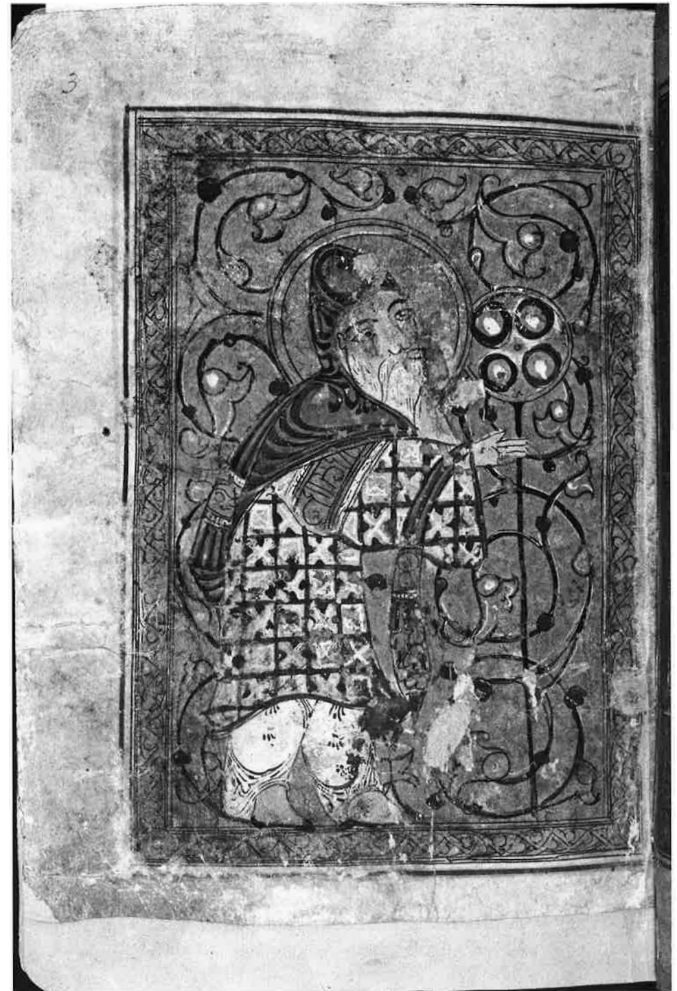
FIGURE 17.6 Frontispiece with a sage holding a flabellum . Ibn Bakhtishu’, Kitab Na’t al-Hayawan , probably produced in Baghdad, c. 1225. London, British Library, Or. 2784, fol. 3r.

However, as might be expected, most of the illustrated manuscripts of this period that lack colophons identifying patrons reveal no such connections. They cover a thematic range that may be broadly described as scientific, and demonstrate not only a concern with topics of professional relevance such as botany or pharmacology but also a lively interest in astronomy and the physical world, including flora and fauna as well as marvels. Typical examples are the 621 (1224) Dioscorides and the c. 1225 Ibn al-Sufi, Risalat al-Sufi fi al-kawakib (The Epistle of al-Sufi on the Stars) in the Riza-yi ‘Abbasi Museum in Tehran (Contadini 2006), in all probability illustrated within the same artistic circle