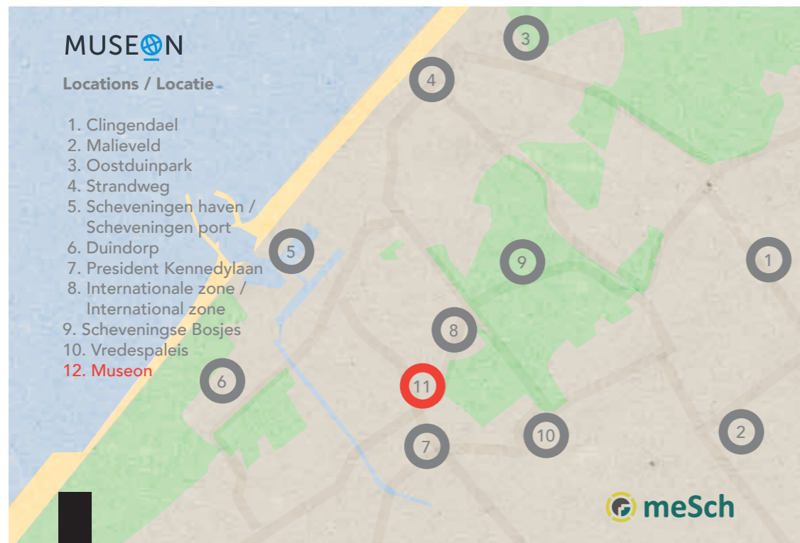
2. Souvenir postcard (Back)