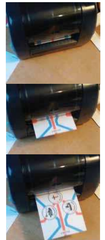
5. Thermal printing overlay

At the end of the visitor's visit they choose to "check out" at which point a souvenir is generated and printed based on the log data. The printing uses a thermal printer for speed and efficiency, once the visitor checks out a card is printed in a couple of seconds. The robustness of the thermal printer was necessary to give confidence to the museum and also to lessen the amount of time staff have to tend to the machine.