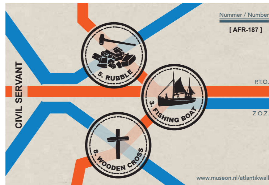
3. Printed card example

This design concept title "lines" uses the visual of crossing lines representing both the wall and lives of people around it. The concept seeks to connect the wall represented by the orange lines with the blue lines representing people's lives connecting with or intersecting with the wall. The design draws some aesthetic from aerial images from the archive of the city to give cohesion as the exhibition features much content based around maps and aerial photographs.