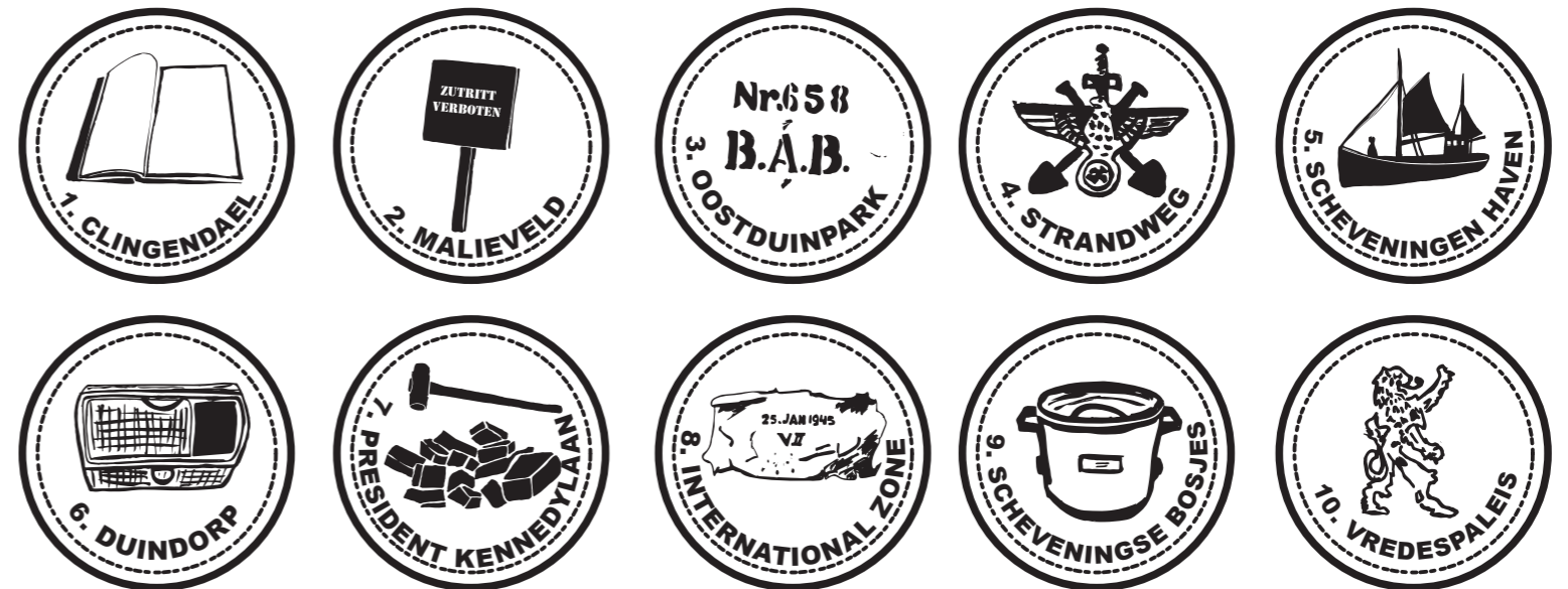
4. Stamps for thermal print