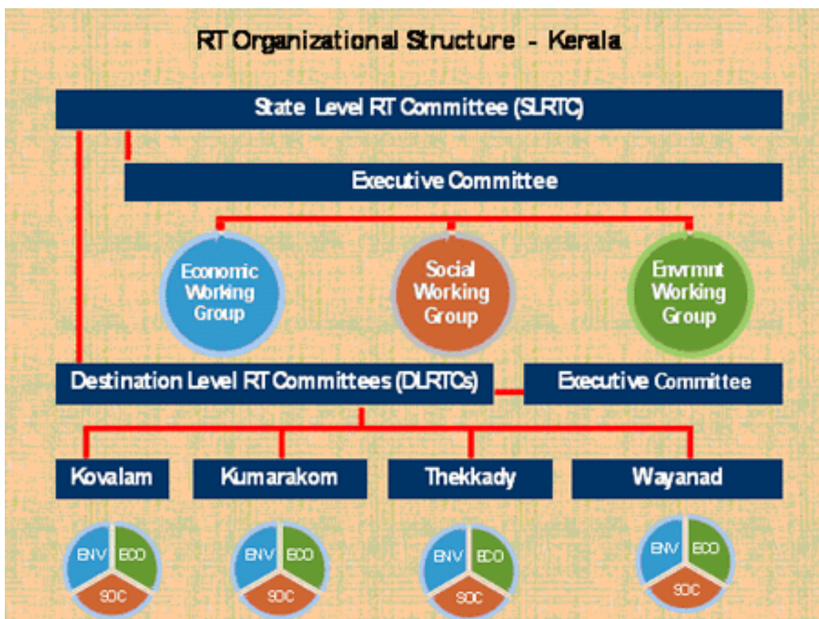
Figure: 2: Organisational layout for the implementation of Responsible Tourism in Kerala (adapted from http://www.keralatourism.org/rt-impactsocial.php (accessed 22nd October, 2011)

and the ecological sensitivity of the destination. These were Kovalam (a coastal destination), Kumarakom (a backwaters destination), Wayanad (hill resort destination) and Thekkady ( a wildlife reserve with contained settlements). Further three state level multi-stakeholder Working Groups were constituted for steering economic, environmental and socio-cultural aspects of tourism management in the state. Three Implementation Cells in each destination supported each of the above three working groups. Further, multi-stakeholder Destination Level Coordination Committees and local working groups were to be formed for each destination to coordinate local action. The state level committees worked on preparation of guidelines for responsible tourism at destinations, and local committees worked on the specificities of implementing the guidelines in locations. Please see figure 2 for the organisational structure for responsible tourism.