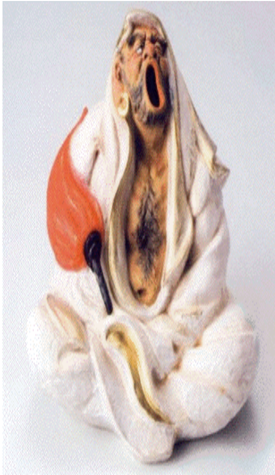
Fig. 5 Japanese sculpture depicting yawning