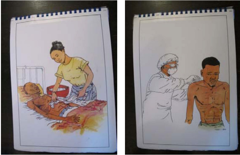
Figure 1. Images from a visual aid used in a public health campaign in DRC compare dangerous with protected caregiving of a patient with Ebola (LNSP/MSASF and France Cooperation N. d.)

of hunting) and developing strategies to curtail outbreaks through quarantine (see Figure 1).