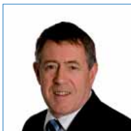
Rt. Hon John Denham MP Secretary of State for Communities and Local Government