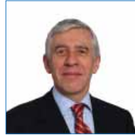
Rt. Hon Jack Straw MP Lord Chancellor and Secretary of State for Justice