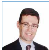
Rt. Hon Andy Burnham MP Secretary of State for Health