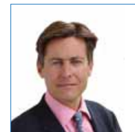
Rt. Hon Ben Bradshaw MP Secretary of State for Culture, Media and Sport

Our aspiration is for every young person in England to enjoy their teenage years and develop into a well-rounded, successful young adult.