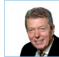
Rt. Hon Alan Johnson MP Secretary of State for the Home Department