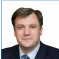
Rt. Hon Ed Balls MP Secretary of State for Children, Schools and Families