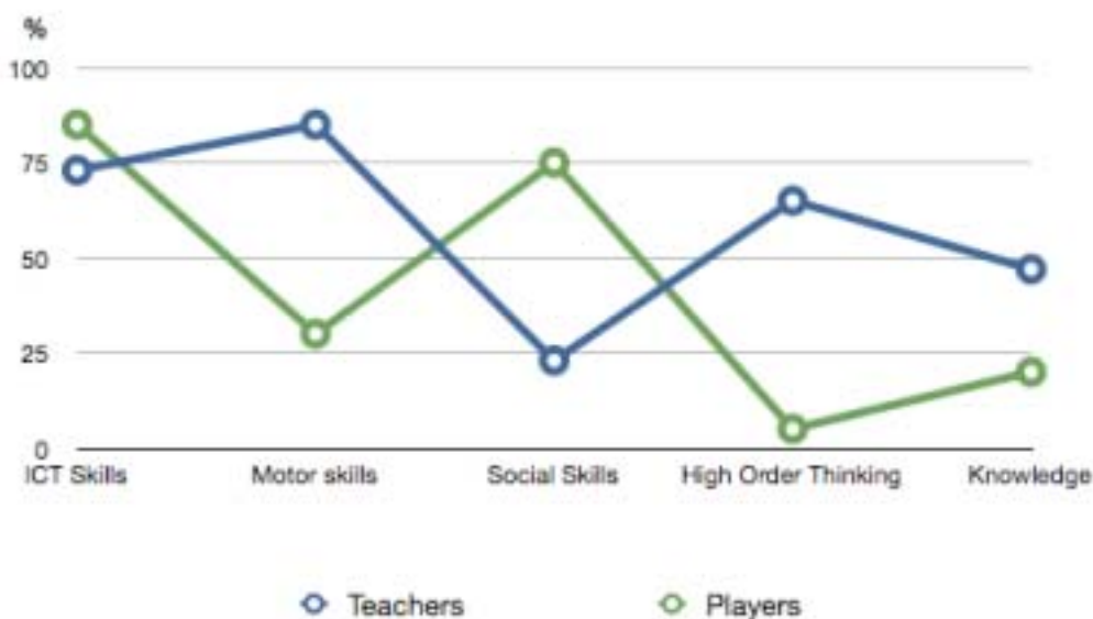
2: Correlation of Learning Outcome Perceptions

believed that motor skills such as hand/eye coordination and reaction times were increased (85%), high-order thinking skills such as problem solving and strategic thinking were improved (65%), and declarative knowledge in specific areas was gained (47%). The players perceived that computer games provided little, if anything, for the above learning outcomes. Contrary to the teachers, in the social skill category, players believed that collaboration and communications skills were gained from games (75%) whereas the teachers did not (23%). Both teachers and players agreed that ICT skills, the use of technology, were improved, but as many of the players stated, this would be obvious.