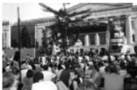
10,000 people at a BID concert in Washington

w w w . k i n g s t o n f i r s t . c o . u k