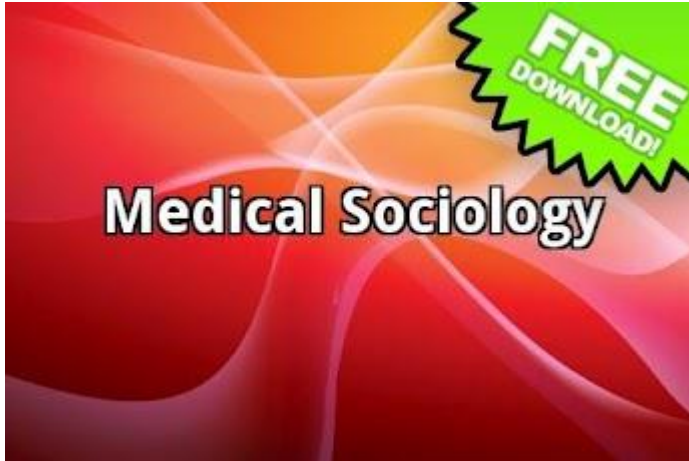
The front page of my 'Medical Sociology' app

My decision to make an app stemmed from two major reasons. First, I have long been interested in the ways people interact with computer technologies, and have published some research on this in the past. More recently my interest has turned to health-related apps available for smartphones and tablet computers. I had been researching the various apps available for such purposes and had noted that many apps have been developed for teaching purposes for medical students.