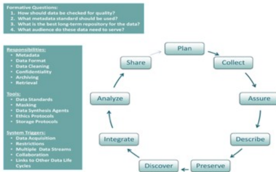
Figure 1. The life cycle of data: the steps needed to responsibly collect, record, store, and steward data.