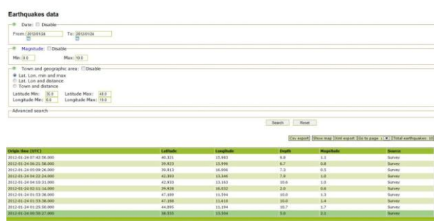
Figure 1 – The ISIDE web portal

The national seismic network allows to record every year more than 10,000 earthquakes throughout the country: as agreed with the Civil Protection Department of Italy, the events with magnitude ML greater than 2.0 are published on the website of the Centro Nazionale Terremoti ( http://cnt.rm.ingv.it ). At the same time all the earthquakes, also the ones with magnitude less than 2.0, are published in ISIDE "Italian Seismic Instrumental and parametric data-base" ( http://iside.rm.ingv.it ), a database-catalog where earthquakes are stored together with the seismic data of the "Italian Seismic Bulletin" since 2005 (Figure 1).