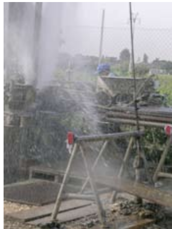
Figure 2. Photo of blowout event.

to sample volcanic and sedimentary sequences. Wire-line coring allowed for a very good core recovery (about 99%) that enabled reconstruction of the detailed stratigraphy of the volcanic units down to the Plio-Pleistocene sedimentary basement. From top to bottom the borehole stratigraphy consists of the typical volcanic succession pertaining to the Tuscolano-Artemisio Phase of activity, spanning the interval 561–351 ky and a Plio-Pleistocene sedimentary sequence characterized by ~150 meters of consolidated clays underlying a ~20-m-thick sand layer followed by sand at the hole bottom (the last ~5 m).