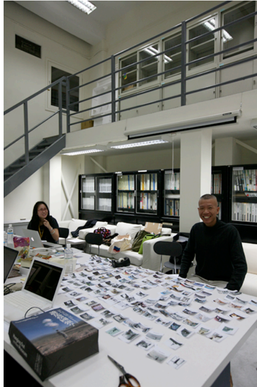
Figure 32. Cai and the studio team are working on an exhibition at the Taipei Fine Arts Museum. 36