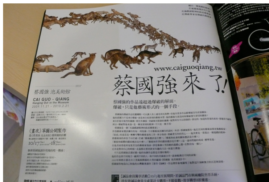
Figure 37. Advertisement for ‘ Hanging Out in the Museum ’ displayed on the advertising pages of the Eslite department store magazine published in October 2009. 93