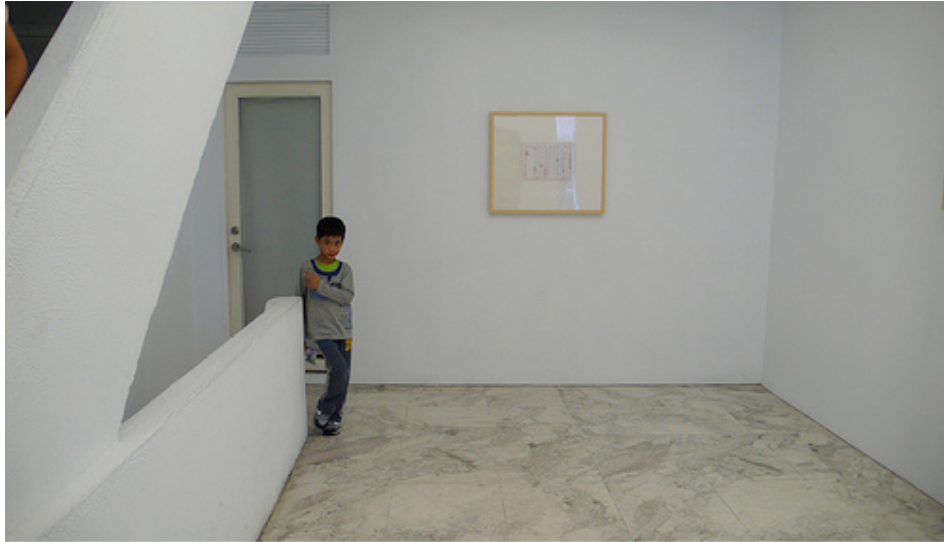
Figure 64. The exhibition space on the first floor of the IT Park Gallery. 71