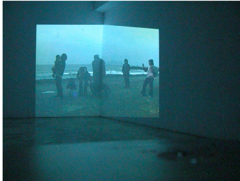
Figure 50. Tang's project I Go Travelling V—A Postcard with Scenery (2005) at the IT Park Gallery. 38

Although the art magazine ARTCO said that “at first it sounded a bit ridiculous”, 39 the project was nominated for the Taishin Arts Award because