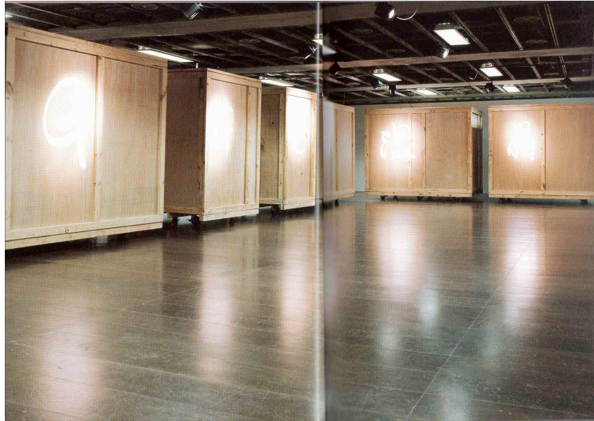
Figure 20. Exhibition Sixteen Close Encounters at Eslite Bookstore (2006). 48

curatorial projects, as well as having an established reputation through her work as an advisor and committee member for some significant awards and organisations. 47