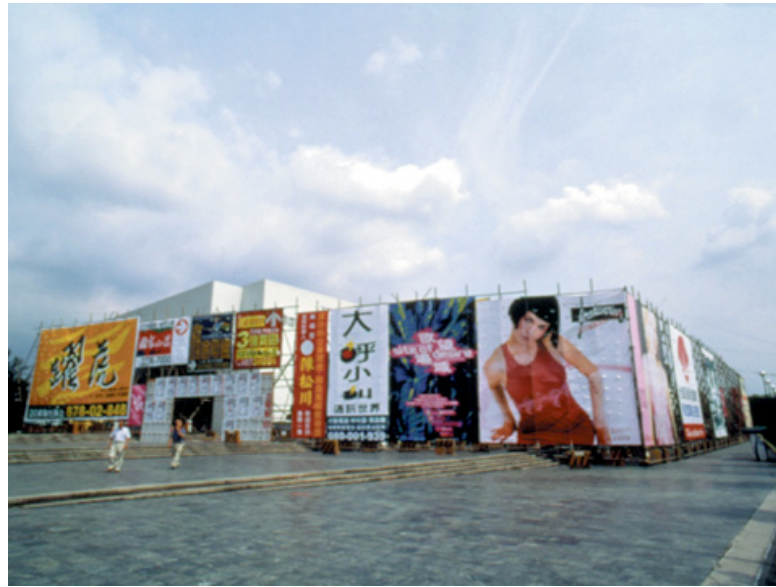
Figure 34. The project Advertising Castle was display outside the Taipei Fine Arts Museum, and consisted of castle-like walls made of large-scale scaffolding. (1998) 61

Cai's status of being an 'art star' was not only due to his position in the international art world, but also because of the controversial political topics that he chose to present through his art works, and the debates these generated in Taiwanese society.