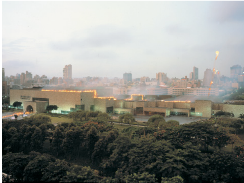
Figure 35. The project No Destruction, No Construction: Bombing the Taiwan Museum of Art at the Taiwan Museum of Art (1998). 73

since the museum opened in 1988. 71 Not only did the public gather for Cai's explosion, but the international media outlets including CNN, Associated Press, Reuters, L'Agence France-Presse and NHK all broadcast the exhibition live. Along with generating further fame for Cai, the event successfully 'internationalised' the National Taiwan Museum of Fine Art. 72