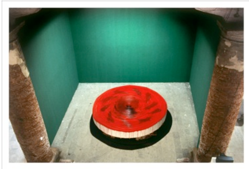
Figure 13. Lee's installation work Fireball and Circle . 87

to act it out is a type of funeral ceremony, it is my father's funeral ceremony. To act it out is to atone for the crimes against endangered species, forests, nature and ecology. To act it out is an active expression of my attitude toward life and the environment. 86