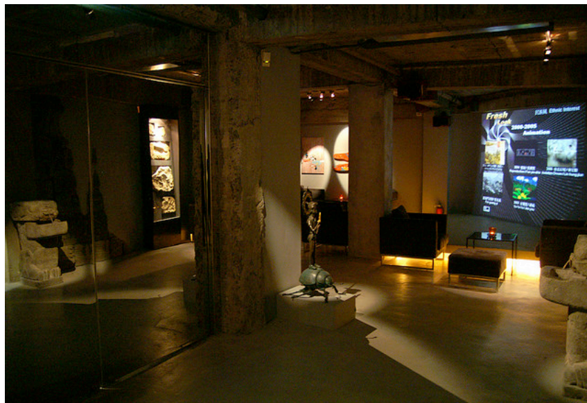
Figure 58. The interior space with art works displayed and a big screen for video art works to be projected. 25

As art is its core interests, the VT Artsalon's key display concepts are two permanent visual art installations and a special exhibitions that change every three months. At its opening in March 2006, the art works displayed on the walls were produced by the artists of the VT Artsalon Group, and were all serious art works that had been shown previously in galleries or museums, or had received art prizes. Some of the art works displayed in the lounge space included Tu Wei-cheng's works in imitation of the architecture and sculpture of an ancient civilisation, located by the main entrance; Yao Jui-chung's works The Cynic—Chinese and The Cynic—Taiwanese (2004-2005), and Ho Meng-chuan's You can only love me (2005). The Artsalon's first special exhibition was called 100 Very Video Art Installations , 24 which included videos projected onto a big projection wall every night for a period of three months.