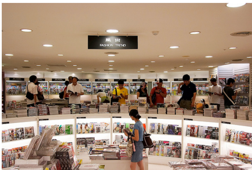
Figure 21. A view on the magazine section in the Eslite Bookstore, Dun-nan branch. 50