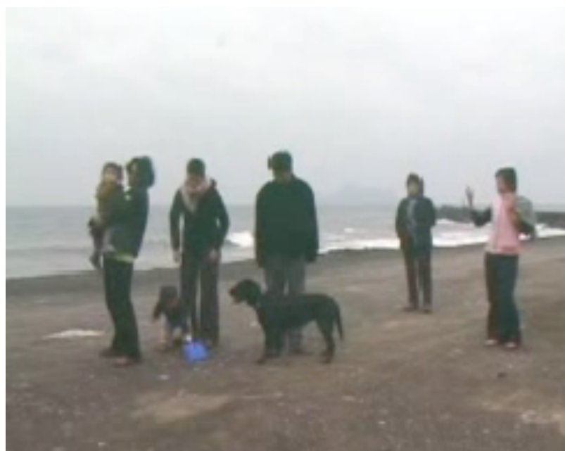
Figure 49. The group of local travellers who were recruited by Tang tried to compose the scenery according to their understanding of Tang's textual instructions. 37