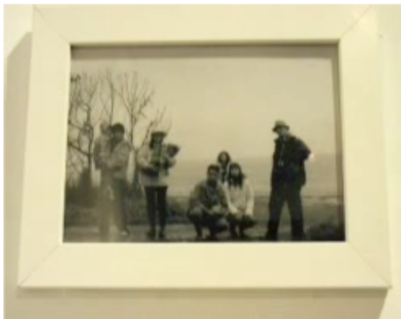
Figure 48. Tang's award winning project I Go Travelling V—A Postcard with Scenery (2005) is based on scenery in an old photograph. 36