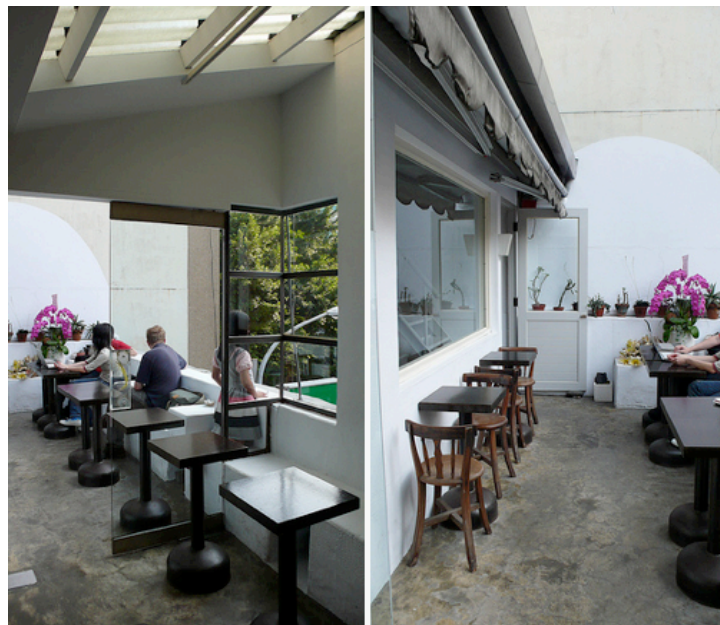
Figure 65. The balcony space on the second floor of the IT Park Gallery. 72

Due to the fact that the IT Park Gallery hoped to provide opportunities for artists to converse with each other, the interior structure was built around the concept of a ‘bar’ and gallery, in order to meet the purpose. However, the idea of ‘bar’ at the