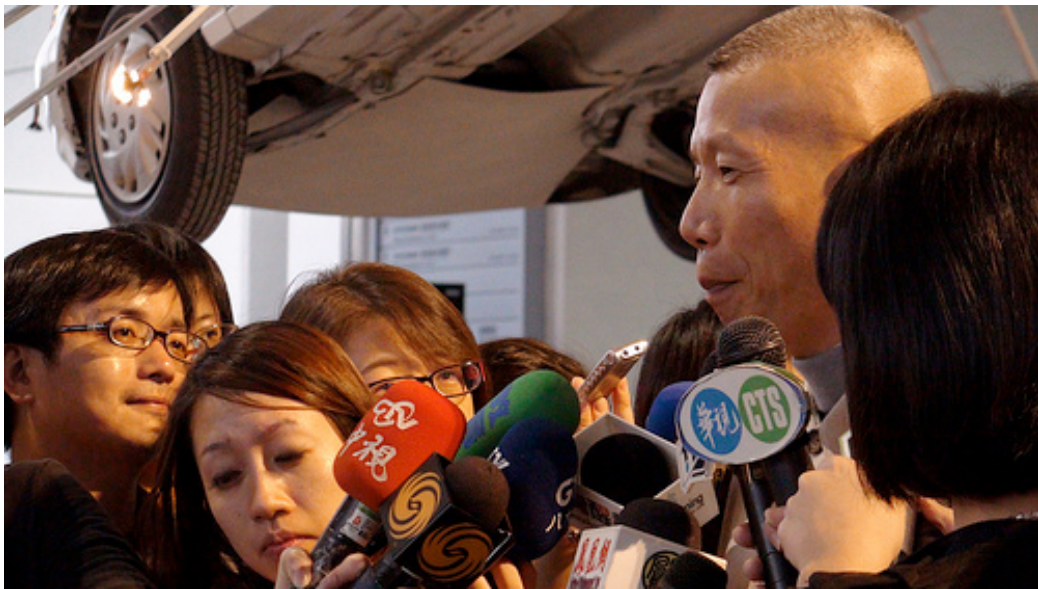
Figure 30. Cai Guoqiang is surrounded by journalists in his retrospective exhibition at the Taipei Fine Arts Museum. 1