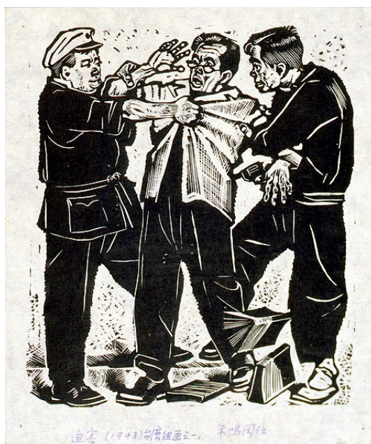
Figure 1. Zhu Minggang's work Persecution (1948) 11

sensitive. Some early examples include Huang Yan's A Person Down, Millions of People Stand Up (1948) and Zhu Ming-gang's Persecution (1948) that depicted scenes of persecutions which were banned during the white terror period and which could not be publicly displayed until 1999, years after the lifting of martial law, when the exhibition The Others in Times—the Artistic Witnesses of the 228 Times was held at the Taiwan Museum of Art. 10