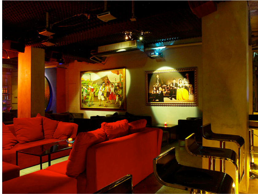
Figure 68. The lounge area in the VT Artsalon after transformation. One can see that there are still art works displayed on the walls, but it no longer claims these displays of artworks as exhibitions. 92

After the VT Artsalon transformed its business strategy and started to sustain its business successfully by selling art works, the group's celebrity status also experienced some change. Some of the news reports started to introduce the VT Artsalon group as entrepreneurs. For example, the 'Business Weekly' section in Economic Daily News carried a report on the group's successful transformation after one year of continuous commercial loss. In addition to a brief description of the establishment and its art works, the report focuses on the reasons for the losses and the successful business transformation of the VT Artsalon since 2007. The article also showed the appearance of the artists in photographs in which they showed off their great confidence, and were described by the article as the 'masters of chasing dreams' ( zhuimeng gaoshou ). 93 The report suggested that the 'secret of their success' was that: