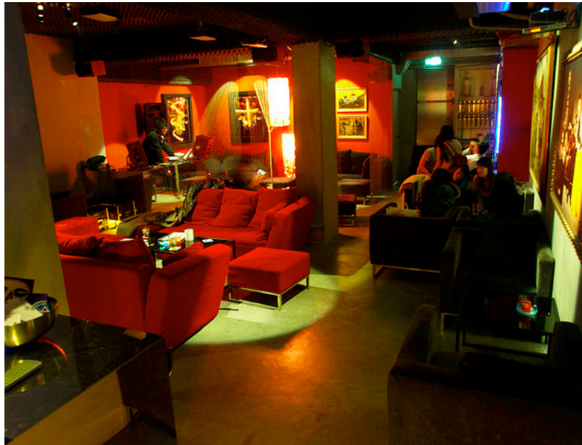
Figure 61. The lounge space in the VT Artsalon with serious art works hanging on the walls. 44

Mark Hutchinson has suggested in ‘Notes on the Idea of Site’ that “ideas about alternative sites for art are often associated with the desire to escape from the perceived constraints of non-alternative sites in some way”. 45 For the VT Artsalon group, their desire to escape from conventional space was accomplished through the construction of the VT Artsalon space as an ‘alternative site/space’. Here, the group could begin to put their ideas about art and the artist’s identity into practice. However, in the process of turning themselves into business operators who run a commercial space—from ‘cultural producers’ to ‘cultural traders’—the main characters that they try to promote, ‘art’ and ‘artists’, were unavoidably commodified as the space’s key selling point as an unconventional art and lounge-bar space. As Julian Stallabrass put it, “As commodities have become more cultural, art has become further commodified, as its market has expanded and it has become increasingly integrated into the general run of capitalist activity”. 46