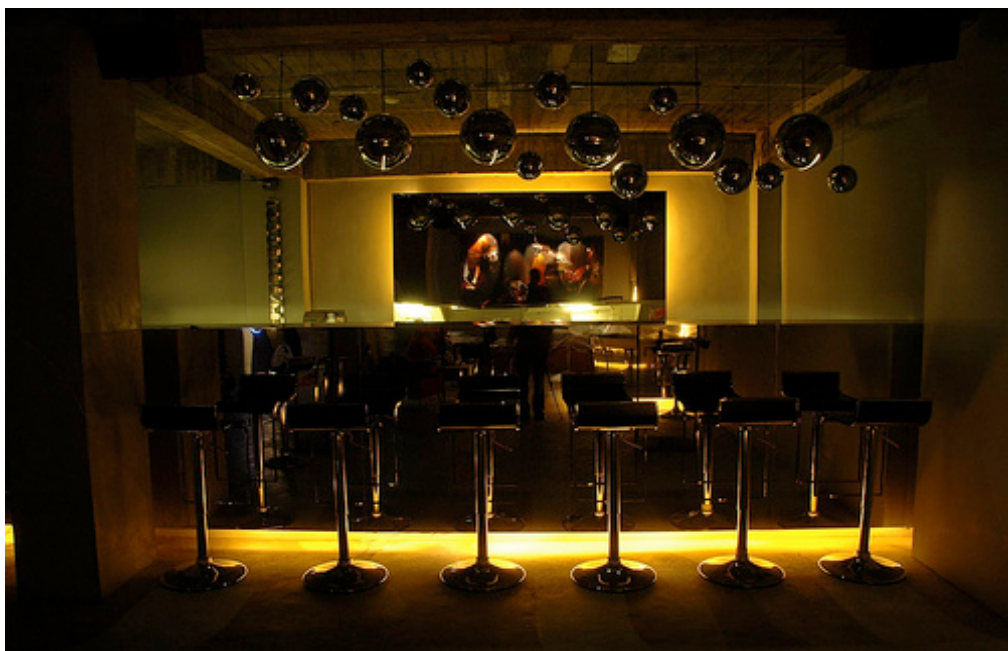
Figure 57. The bar area at the VT Artsalon. 23

The VT Artsalon's ambition of being a creative petri-dish is manifested in three aspects. The first can be seen from its particular way of displaying art works. Graphics and paintings are hung on the walls around the lounge seats, while sculptures and installations are placed by the main entrance or allocated between the sitting areas. One might suggest that this way of displaying art is closer to the concept of artwork as decoration, but in an art salon run by a group of artists, the art works are one of the major characters within the space. The second aspect of its petri-dish character is shown in its creative lists of art activities and programmes. Since its opening in 2006, the VT Artsalon has aimed to bring together the various fields of visual art, design, architecture, performance, music and literature, and to integrate them with social life. The Artsalon's art, cultural and social activities were not only to provide audiences with diverse visual and sensory entertainment, but were also designed as part of a strategy to popularise the space and promote the name of the VT Artsalon. The third aspect of the VT Artsalon as a creative petri-dish is manifested in its function as a new social space for artists and people from the arts and cultural communities to gather.