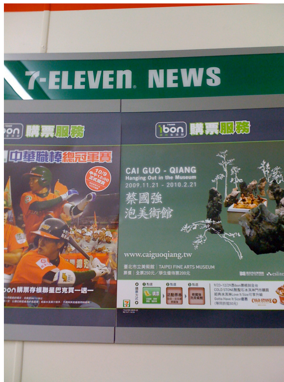
Figure 36. Advertisement for the exhibition ‘ Hanging Out in the Museum ’ on the notice board at a 7-11 Convenience Store. 92