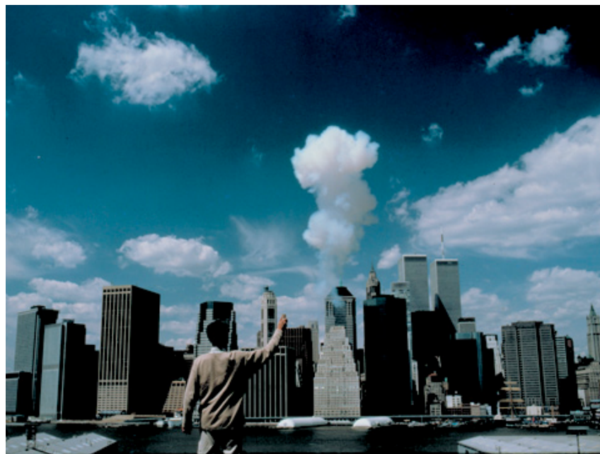
Figure 31. Cai's project The Century with Mushroom Clouds: Project for the 20th Century (1996) was enacted at various sites. Here it is in front of the Manhattan skyline. 28

In 1996 his art works were mainly exhibited in important art museums, such as the project Cry Dragon/Cry Wolf: The Ark of Genghis Khan in the Guggenheim Museum, New York; and Crab House in P.S.1 Contemporary Art Center, New York. After 1997, Cai Guoqiang's art works and projects were being exhibited around the world, included Denmark, Austria, Italy, Turkey, France, Sweden, and other countries. 27