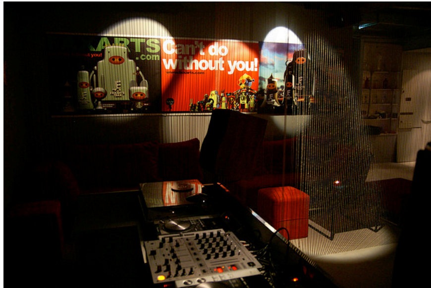
Figure 59. A scene at the Manga Exhibition, and the technological equipment for DJ nights. 30