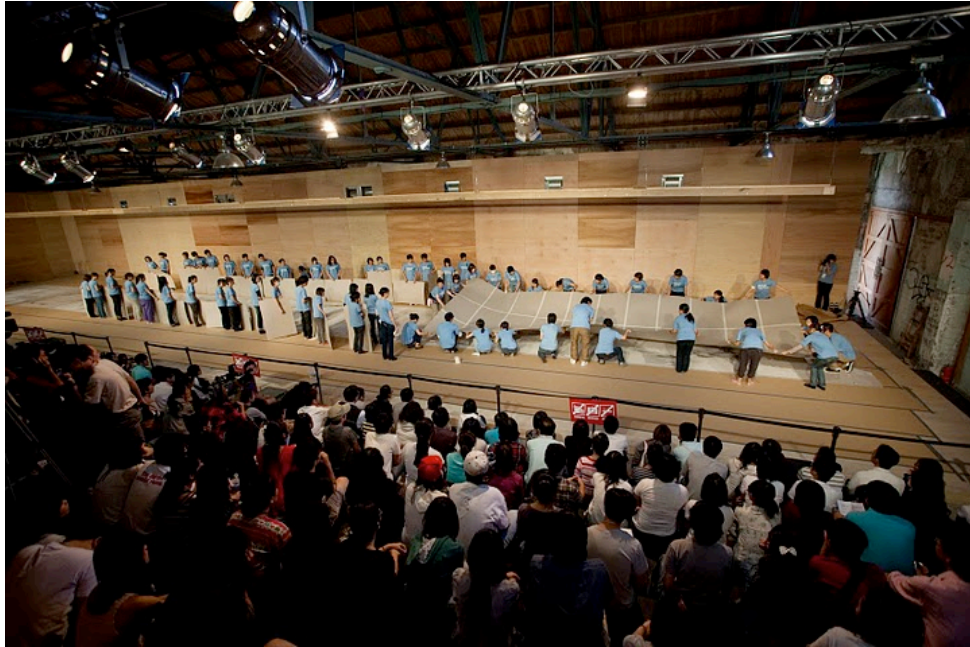
Figure 43. Cai's assistants helped to cover the work with boards to prepare for a later explosion. 114

In addition to the various mass media reports on this event, Cai also attended talk show programmes to promote his exhibition. There are two categories of talk show programmes in Taiwan, as previously mentioned in chapter four: political commentary talk shows and entertainment talk shows. The one Cai attended was an entertainment show, Shen Chunhua Live Show , hosted by former television news presenter Shen Chunhua. 115 Cai attended the programme with a celebrity friend Chen Wenqian, who was an ex-politician and had been a controversial figure in Taiwanese politics. Cai was not only interviewed about his art and the creative process, but also his personal background and life. Celebrity Chen's presence was to offer her opinion on Cai's art and her personal feelings towards Cai. Cai sat very comfortably and confidently on the sofa chatting to Shen and Chen, fluently responding to the