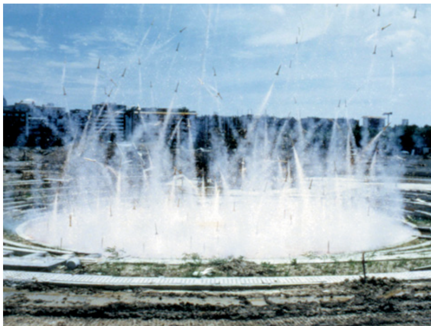
Figure 33. The Golden Missile project at the Taipei Fine Arts Museum (1998). 59

second reason was because the topic of this project recalled a missile test by the Chinese Communists Party in the end of 1997 in the Taiwan Strait, which was construed as a highly provocative act. Cai's missiles were equipped with a parachute device. After they landed on the ground, the missiles became 'artworks' that could be picked up by the audience. This scene was a reflection on the scene of people living in Kin-men picking up shrapnel that they found on the ground to make kitchen knives as a response to the tense relationship between Taiwan and China. 58 This kind of metaphysical reflection on cross-strait relations is embedded in many of Cai's art works produced for the Taiwanese context, and considering Cai's identity as a Chinese artist working in Taiwan have a strong political significance. This will be discussed more deeply in the following sections.