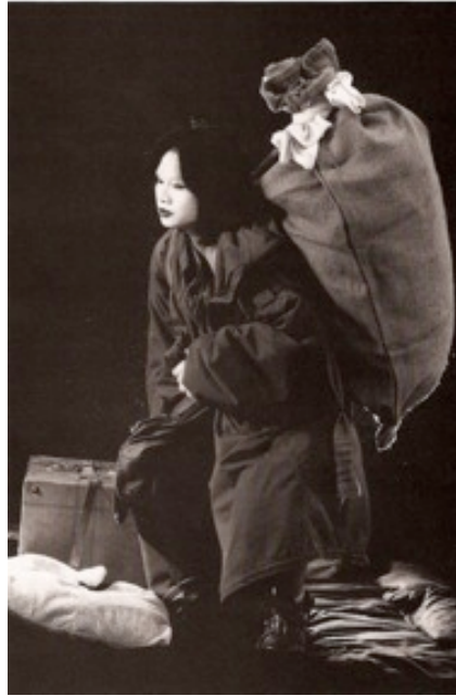
Figure 3. Bundle 119 , Performance costume. 9

A similar situation occurred with another performance project, Bundle Number 119 (1984), in which Lee used his body to perform in an even more intensive and pressurized way by continuously carrying a three-kilogram bundle for 119 days. 10 Lee's aim for this project, on the one hand, was to use the bundle as a symbol of confinement during the martial law period; and on the other hand, he wishes to draw the public's attention to the social and cultural environment that could, once the bundle was removed, lead to a better life for the public and the artist. However, instead of successfully achieving these aims Lee and his performance art project became the object of taunts, especially by the mass media,