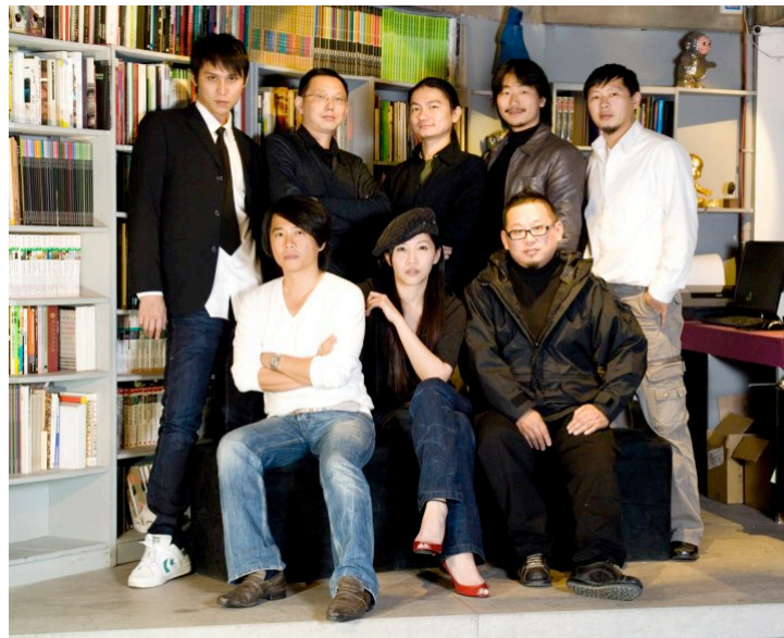
Figure 69. A photograph of the VT Artsalon group taken in the gallery space after the transformation took place. 96

Despite the VT Artsalon's change in business strategy and its space layout, it still plays an important role in bridging high art and popular culture in the Taipei. This is due to the fact that although the spaces are divided, there is no partition between the spaces and they share the same door. Through the lounge-bar space still has serious art works hanging on its wall, although the bar space is no longer described as an art-lounge space. Furthermore, by renting the lounge-bar space out for other activities, it still welcomes different artistic, cultural and creative activities. For instance, a fashion magazine GQ Taiwan selected the lounge-bar space of VT Artsalon for a series of fashion photograph shootings in August 2009, 97 and a screening of the film Water in Milk Exists in the Urban Nomad Film Festival was held in the VT Artsalon in September 2009. 98 Such cooperation with other cultural