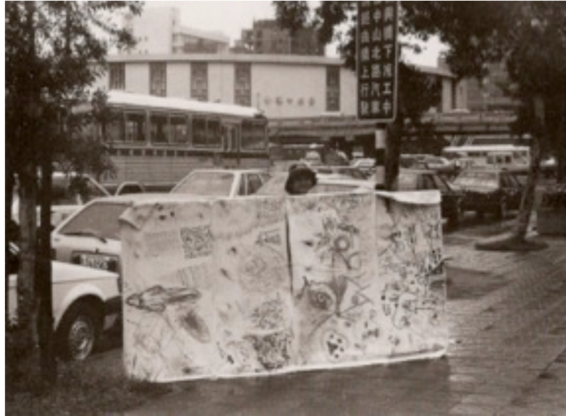
Figure 5. Medical Examination of Taipei Fine Arts Museum, Part 2 . Lee Ming-sheng displayed his painting on the pedestrian area in Taipei. 28