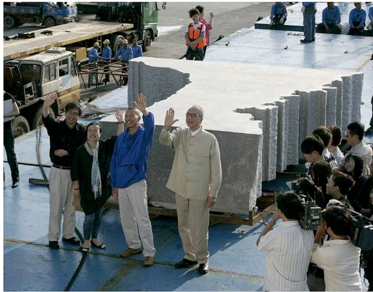
Figure 39. A celebration at the arrival of Cai Guoqiang's work Strait . (From left: Yang Zhao, Xie Xiaoyun, Cai Guoqiang and Wu Qingyou). 102

consider here as a form of publicity event was the open production of the work Day and Night , 101 which Cai launched by making an explosion art work for the public and the media.