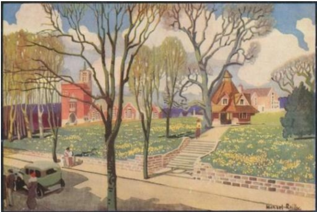
Fig. 2.3. This artistic interpretation of Bournville Village Green in 1929 emphasises the importance of open spaces, trees and grass in the village. The Bournville Village Schools can be seen to the left of the image. From The Bournville Village Trust (Bournville: Bournville Village Trust, 1929)