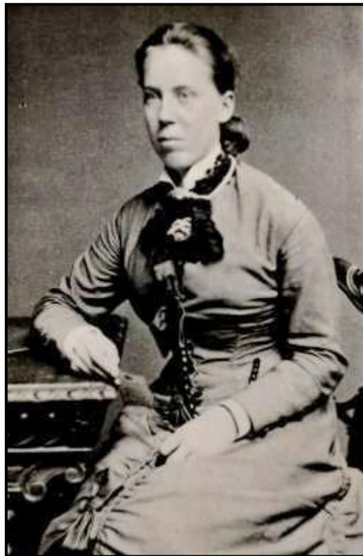
Fig. 1.2. Elizabeth Taylor as a young woman, c. 1874. MS 466/3/1/5, Cadbury Family Papers, Birmingham Archives & Heritage Service.