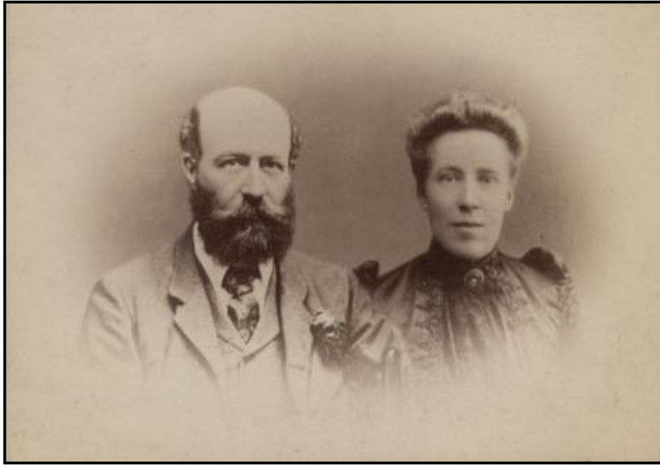
Fig. 1.3. A composite photograph by Birmingham photographer E. B. Momll showing George Cadbury and Elizabeth Taylor at the time of their marriage in 1888. MS 466/3/2/10, Cadbury Family Papers, Birmingham Archives & Heritage Service.