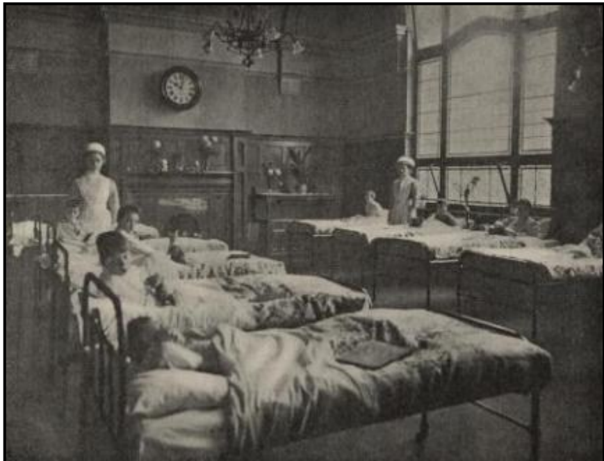
Fig. 4.2. Photograph showing the ward at the Tonsil and Adenoid Clinic established by the Hygiene Sub-Committee at Soho Hill, Handsworth. The image was featured in an article written by Taylor Cadbury about Birmingham's school medical service for The Child in 1916. MS 466/1/1/10/4/8, Cadbury Family Papers, Birmingham Archives & Heritage Service.