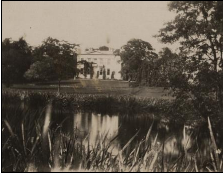
Fig. 1.5. Elizabeth Taylor Cadbury's first home as the wife of George Cadbury, Woodbrooke in Selly Oak. The family lived here until 1894. This photograph was taken in 1885. Woodbrooke was transformed into a Quaker Settlement which opened in 1903. MS 466/3/2/8/2, Cadbury Family Papers, Birmingham Archives & Heritage Service.