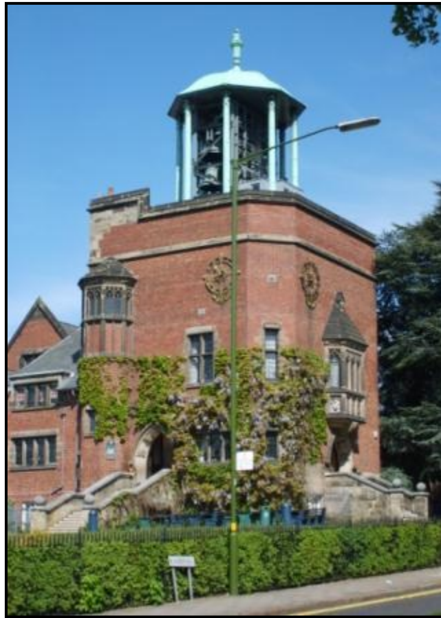
Fig. 3.3. Bournville Junior School, Linden Road, Bournville, 2009.