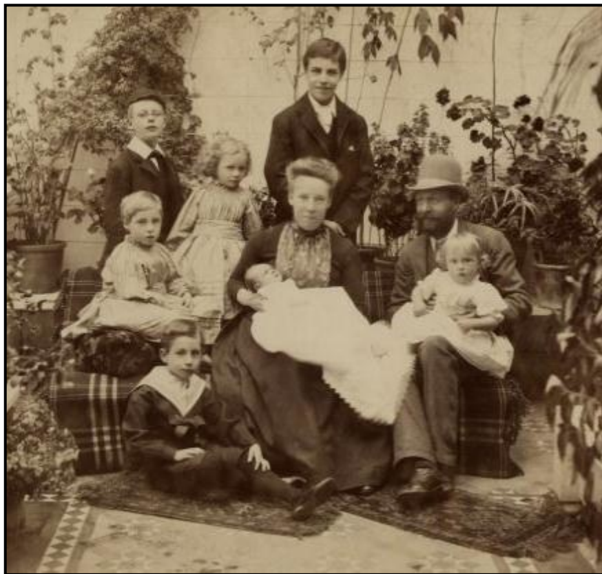
Fig. 1.4. The Cadbury family, c. 1890s. MS 466/3/2/11, Cadbury Family Papers, Birmingham Archives & Heritage Service.