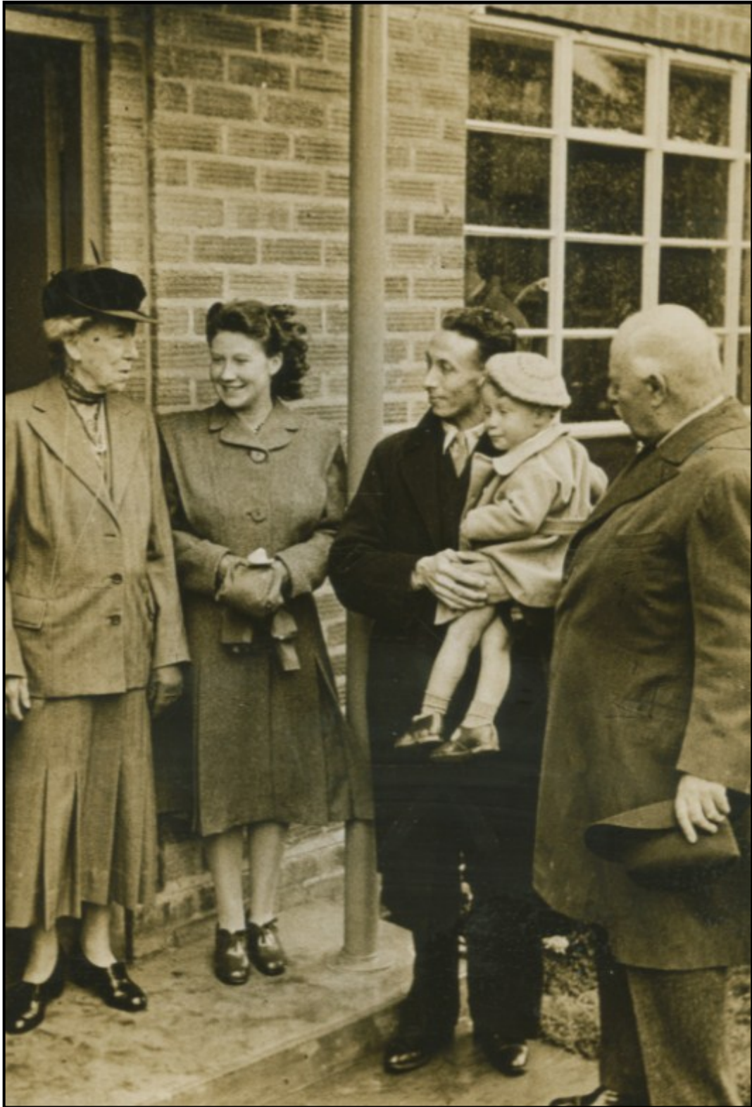
Fig. 2.4. Elizabeth Taylor Cadbury maintained a close involvement with the Bournville village community throughout her life. This photograph shows her speaking to prospective tenants in 1946 with her stepson Edward Cadbury. MS 466/3/1/31, Cadbury Family Papers, Birmingham Archives & Heritage Service.