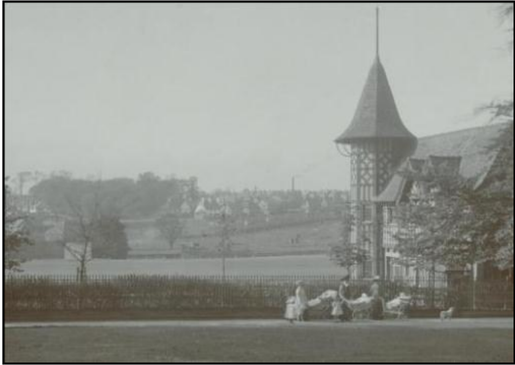
Fig. 2.2. Bournville 1902-1903. Female residents and their children are featured in the foreground. The developing village can be seen in the background with houses on the right and the shops built on Sycamore Road shown on the left.