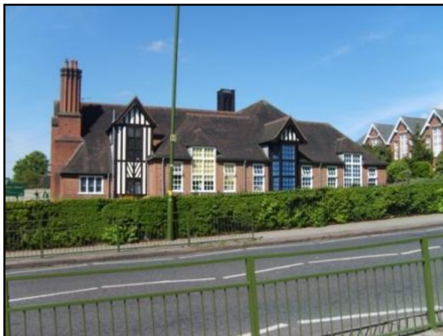
Fig. 3.4. Bournville Infant School, Linden Road, Bournville, 2009.