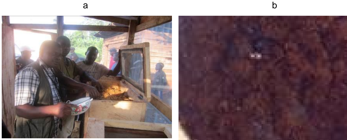
Photo 19: Introduction of adult palm weevils into the experimental boxes

In each of the boxes, ten (10) adult weevils (5 males and 5 females) were destined for introduction. However, since the number of females was limited, only 2 couples, comprising of 2 males and 2 females were introduced per box, after having paired them for 24 hours (Photo 19a and b).