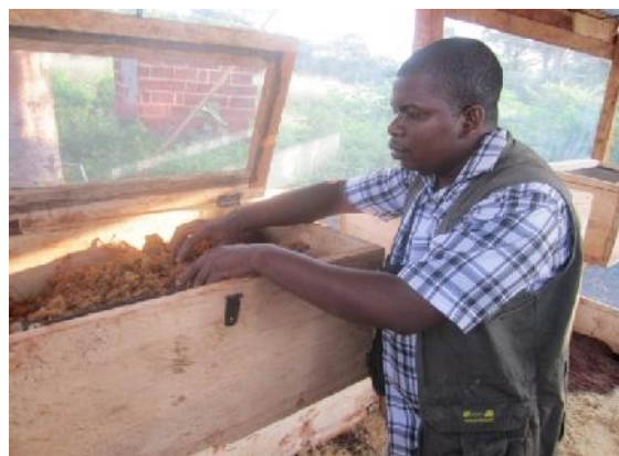
Photo 16: Boxes filled with mixture of fresh and decayed raffia tissues