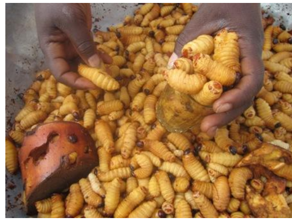
Photo 3: Small scale traders of palm weevil grubs at the Abong-Mbang main market.