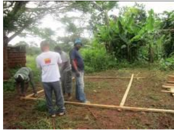
Photo 6: Preparatory meeting with the population Photo 7: Preparation of construction site