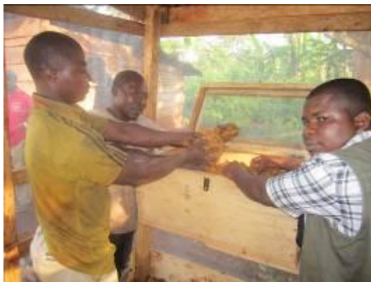
Photo 17: Boxes filled with decayed raffia