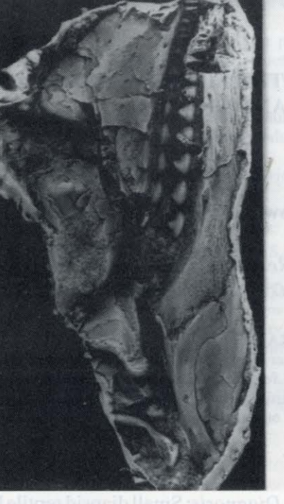
Figure 1: Fremouwsaurus geludens – stereophotographs of a latex peel taken from the specimen

Penidati 2 a awona acitamoa came to the author's attend