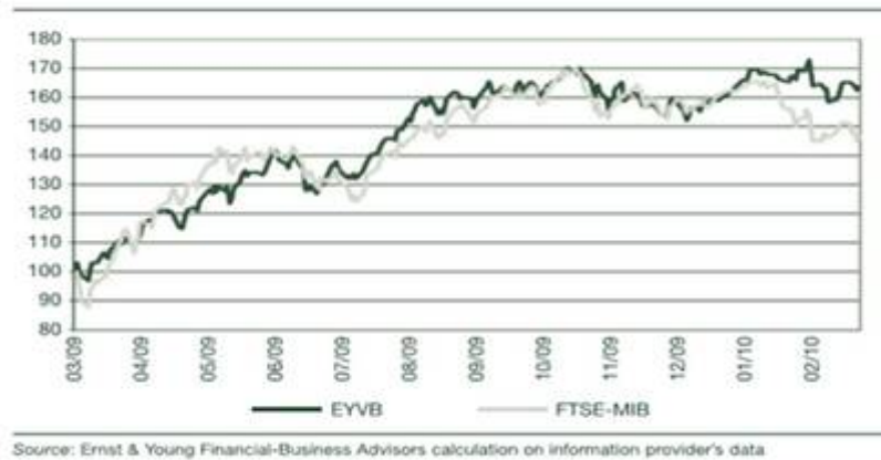
Figure 1: The Ernst & Young VBI

Figure 1(Ernst & Young VBI) shows that the EYVBI generally followed the market trend, though performing better than the latter, especially in the last quarter of 1999. The results of EYVBI indicates that over the period, the index increased by 63.8%, compared to the performance of 46.7% registered by the Financial Times and Stock Exchange -Milano Italia Borsa (FTSE MIB).