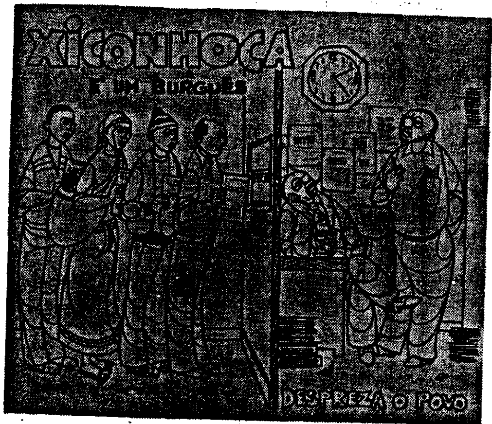
Figure 6. Xiconhoca is a bourgeois. He despises the People.