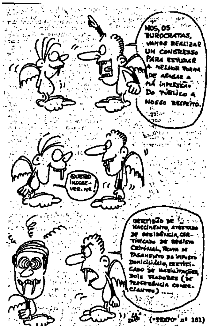
Figure 3. Tempo , 296 (6/6/1976). At the top, a bureaucrat states that the bureaucrats will hold a congress to study the best way to improve their public image. When the figure on the left asks how he can sign up, the big chief begins to list off all the documentation that will be required.