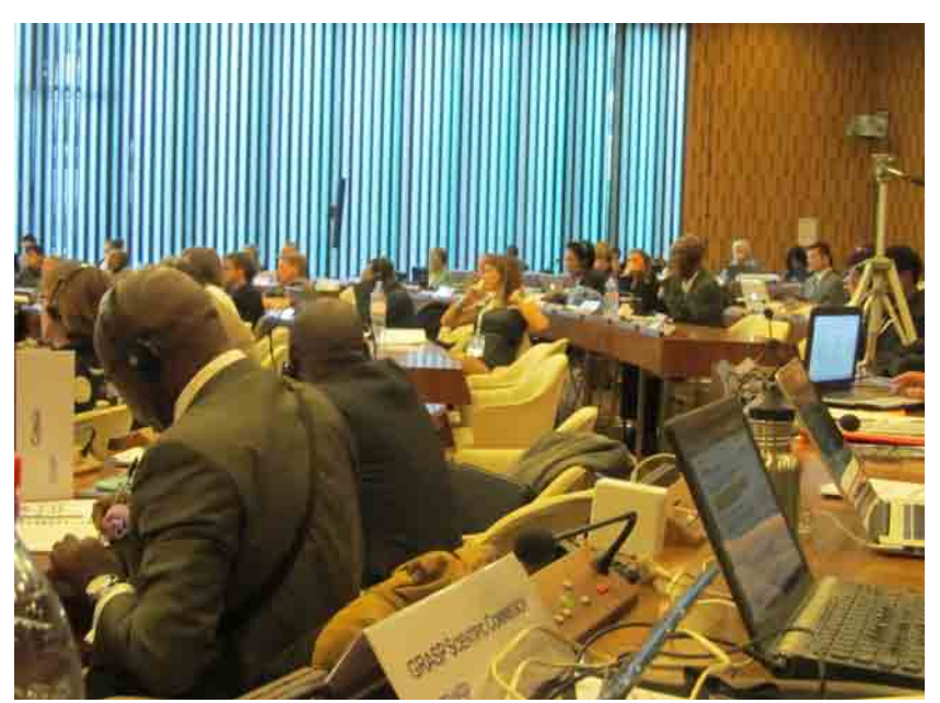
Figure 1. The 2nd GRASP Council was held 6-8 November 2012 at UNESCO headquarters in Paris.

150 people gathered for this 3-day meeting.