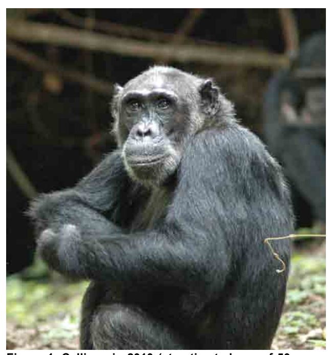
Figure 1. Calliope in 2010 (at estimated age of 50 years old). Although her hair was white, she did not look old.

According to Nishida<sup>1</sup>, Calliope had been very shy to human observers until the 1990s. Although she later became tolerant of observations from a certain distance, she continued to be more timid than the other females. She seemed reluctant to get too close to humans, especially when she had a small baby. Throughout her life, Calliope gave birth to a minimum of 5 offspring ( i.e. , 3 females and 2 males)<sup>2</sup>. Except for 1 female offspring who died at 3 years old, the other 4 were weaned and reached the age of puberty. Thus, it can be said that she was a successful mother. After she gave birth to her last offspring in 1997, she did not give birth again throughout the last 15 years of her life. Excluding the 5 years during which she was nursing her last baby, she enjoyed her remaining post-reproductive life for 10 years.