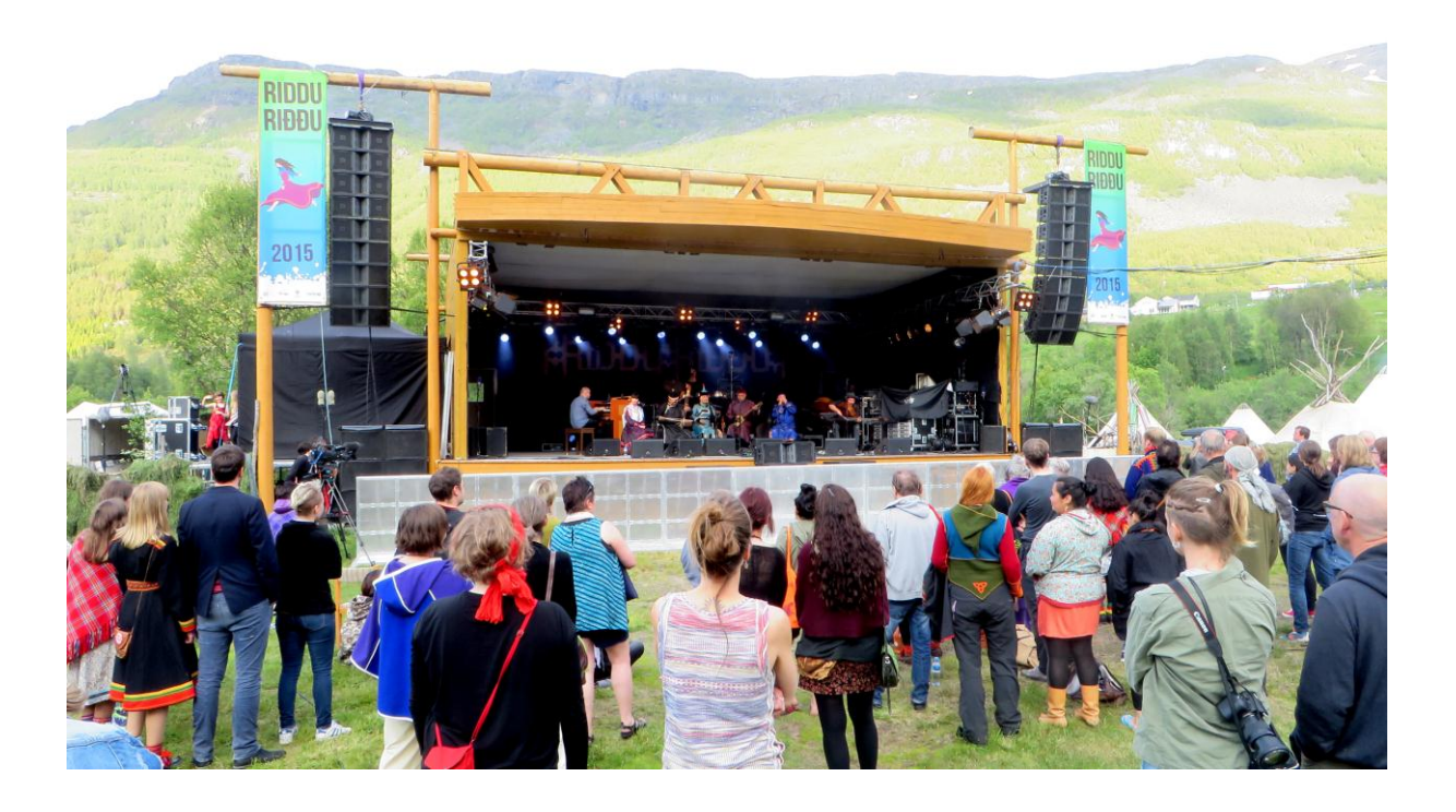
Figure 1. Collaborative Performance of Arvvas & Chirgilchin. Riddu Riddu. July 2015

embody the felt experience through creative works such as music, art, and eventually those who experience these works also can feel these presences that artists experiences through encounters (as cited in Solomon, 1997). The festival is a space where indigenous musicians, artists and audience from around the globe can come together and celebrate their indigenous identity in solidarity through music and other forms of art. Therefore, Riddu Riđđu with its intense history of ethnic revitalization and cultural revival, definitely is a 'contact zone' where cultural actions happen (Hills, 2000) and a symbolic place where musical expression of Sámi and global indigenous identity come to life.