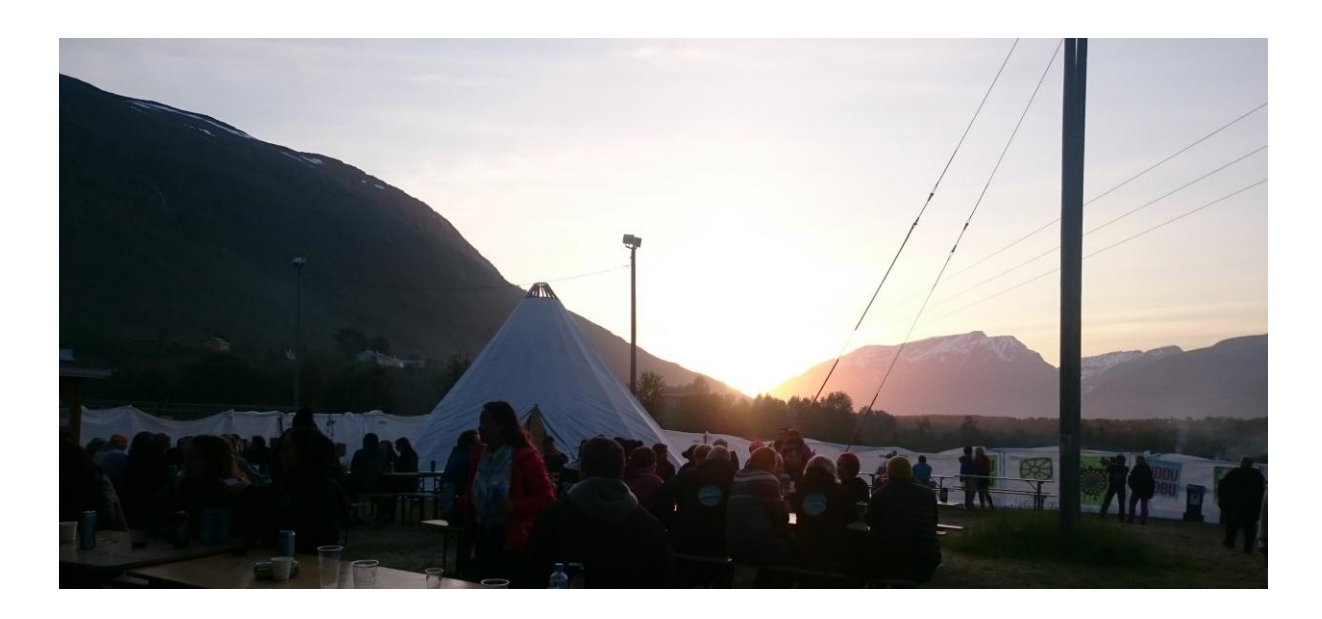
Figure 4: Audiences bidding the day goodbye. Riddu Riddu Festival. July 2015

This music they came from or our algysh . These are very old songs, many years old. They are very good because we can feel it. Sometimes there are these melodies, words, mmm very good words, very nice melodies in these songs.", (I, Koshkendey, personal communication, 9 July, 2015).