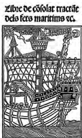
Figure 3. Cover of the book of the consulate of the sea, a compilation of Catalan maritime trade laws.