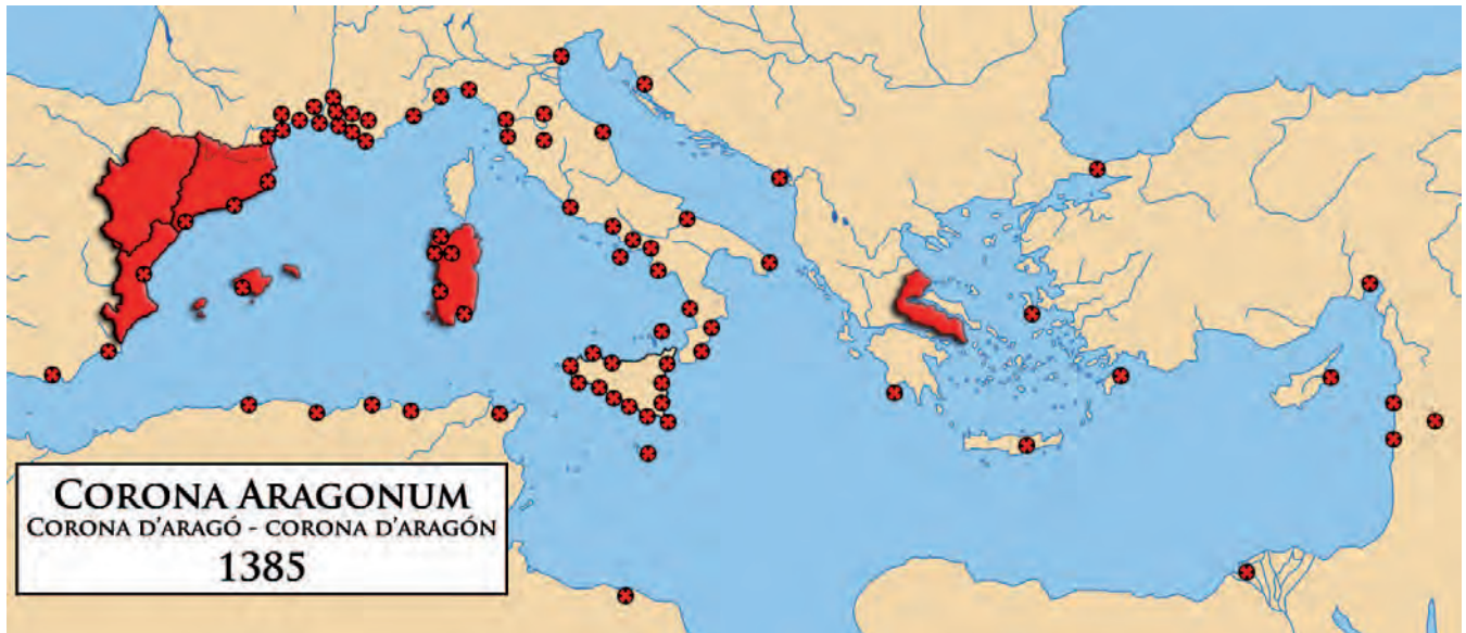
Figure 2. Map of the Catalan consulates and domains in the Crown of Aragon in 1385. The domains of the Crown of Aragon and the sites of the Catalan consulates in the Mediterranean in 1385 are marked in red. Some consulates worked to defend the interests of the local merchants in foreign cities.

Commerce with Sardinia was active before the Catalan conquest of the island, despite the fact that little documentation on it remains. 70 After the conquest, Catalans exported the silver from the mines of La Vila d'Esglésies in ingots or coins, alfonsins , to the Mediterranean Levant, where silver was in great demand, to finance the import of spices until the mid-14th century. The Catalans imported Sardinian wheat, but not regularly because of the long wars with the Giudici of Arborea, as well as pasta (spaghetti), hides and cheese, wild animal hides such as fallow deer, and especially coral, which, after being crafted in Barcelona, was an essential part of the Catalan freight headed to the Levant, a market that absorbed large amounts of it. The Catalans took to Sardinia woollen cloth, sewing notions, oil, rice, saffron, raisins and wine, hemp, glass, Valencian pottery and all sorts of products in small amounts needed for local life. 71