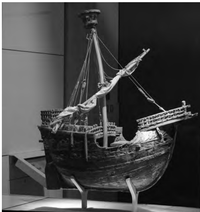
Figure 4. La Coca de Mataró . A 15th century Catalan votive offering which depicts a “coca” (a kind of boat from the time), currently held in the Prins Hendrik Maritime Museum of Rotterdam.

Mallorca and Valencia were the most important platforms on the route to Flanders, the former because it was the repository of African products and the latter because it was the capital of a country with extraordinarily rich agricultural products that were very appealing in Flanders, such as raisins, figs, dates and rice. However, the documentation shows that Barcelona was not left out of the system, because even if the ships did not stop there, the goods were transferred from a coastal boat that was part of a very dense network to a vessel heading northward. What is more, all the Catalan companies had commercial agent in Valencia and Mallorca, where they loaded not only goods that might reach Barcelona but also local goods. The foreign boats that travelled to Flanders, especially those from Genoa and Venice, stopped in Mallorca and Valencia, and often some of the southern ports in Valencia, but they did not tend to stop in Barcelona, although the boats from Florence did. Mallorca was not always the terminus of the line to Flanders, and sometimes it was replaced by Barcelona. The foreign marines were often used on this route, while the Catalan merchant fleet concentrated on other routes, especially in the 15th century. 174