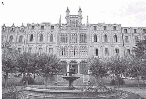
COL·LEGI SANT IGNASI DE SARRIÀ

THE BARCELONA'92 INTERNATIONAL YOUTH CAMP (IYC) OFFERS YOUNG PEOPLE FROM ALL OVER THE WORLD A SPACE FOR CULTURAL AND SPORTING EXCHANGE WITH THE AIM OF FOMENTING AN UNDERSTANDING OF CULTURES AND ENCOURAGING RESPECT FOR AND A SENSE OF BELONGING TO THE WORLD COMMUNITY.