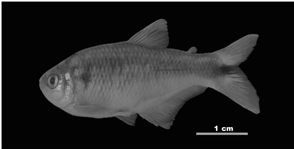
Fig. 1. Bryconamericus caldasi n. sp., holotype, male, IUQ 3714, 63.7 mm SL, San José County, La Libertad Creek, 200 m from La Libertad school on the San José, Arauca Road, Caldas, Colombia.

Fig. 1. Bryconamericus caldasi sp. n., holotipo, macho, IUQ 3714, 63,7 mm de longitud estándar, condado de San José, riachuelo La Libertad, a 200 m de la escuela La Libertad, situada en la carretera de San José a Arauca, en Caldas, Colombia.