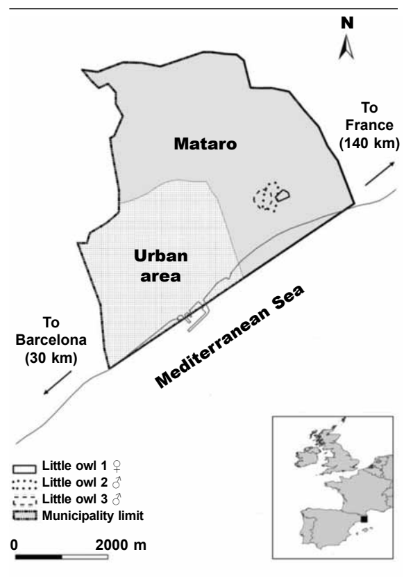
Fig. 1. Location of the study area and minimum convex polygons 100% (MCP100) of the three monitored little owls within the limits of the Mataró municipality.

Transmitters were removed from two of the owls in August and October 2008 and the other three were not retrapped. Monitored pairs bred successfully (2.3 fledglings/pair), two in naturally occurring chambers in carob trees and one most probably in an old concrete irrigation canal.