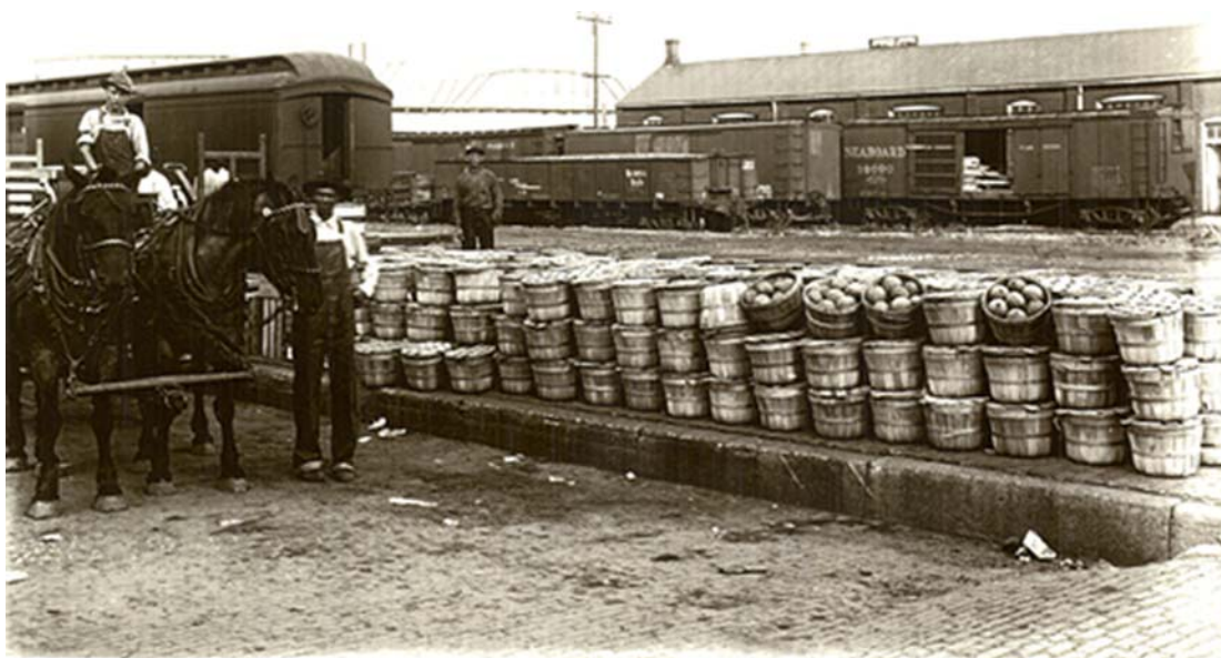
Figure 1: Photo by Oscar Grossheim, from the Oscar Grossheim Collection, Musser Public Library, Muscatine, IA (Title: Crates of melons at depot, 16 Aug. 1920). To view this and other photos go to www.muscatinelibrary.us

Truck growers at this point used domestic farm labor for producing and harvesting, and any other labor needed came from the city of Muscatine. Most of the vegetables were marketed in Chicago, St. Louis, Memphis, New Orleans, and the Twin Cities. Chicago was a 12-hour run by railroad; St. Louis, Kansas City and New Orleans were on direct rail lines, which offered good transportation facilities to the area growers. The Growers Association also reported for the first time in 1925 that Iowa cantaloupes were shipped to New York in carlots.