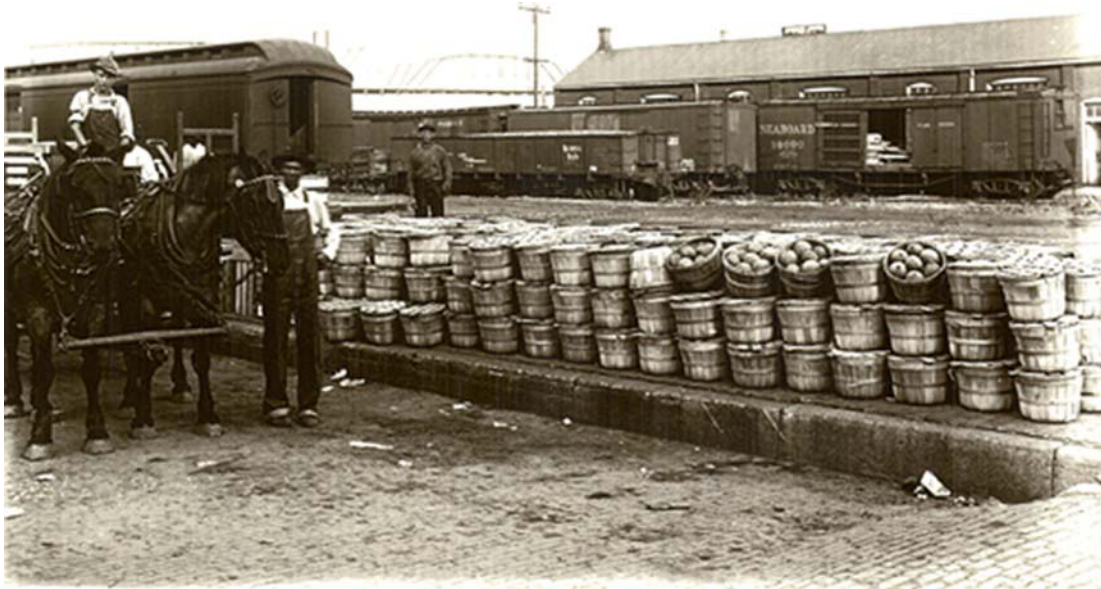
(Title: Crates of melons at depot, 16 Aug. 1920). To view this and other photos go to www.muscatinelibrary.us