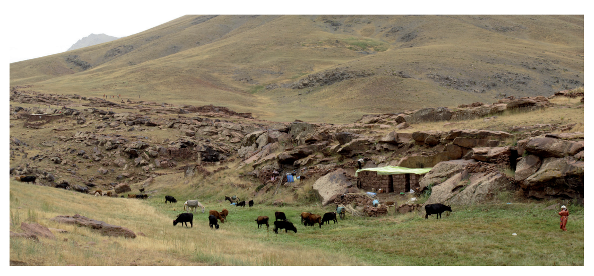
Fig. 2. Cattle grazing in Oukaïmeden in August 2010.

After the pacification, the French authorities decided to build a ski resort and several chalets and hotels in the best and more sheltered valley slope, the one oriented to the south. This was done by purchasing the land from the most prominent tribe, considered direct progeny of the mythical ancestor, which traditionally established their summer village – azib in Berber –there, and moving them to an area with less favourable orientation. By doing this, they destroyed an unknown number of rock art surfaces. Neither do we know how many rock engravings and other archaeological evidences were previously