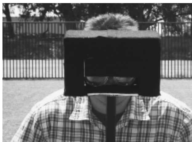
Figure 2. Two views of a participant viewing through the restrictive aperture.