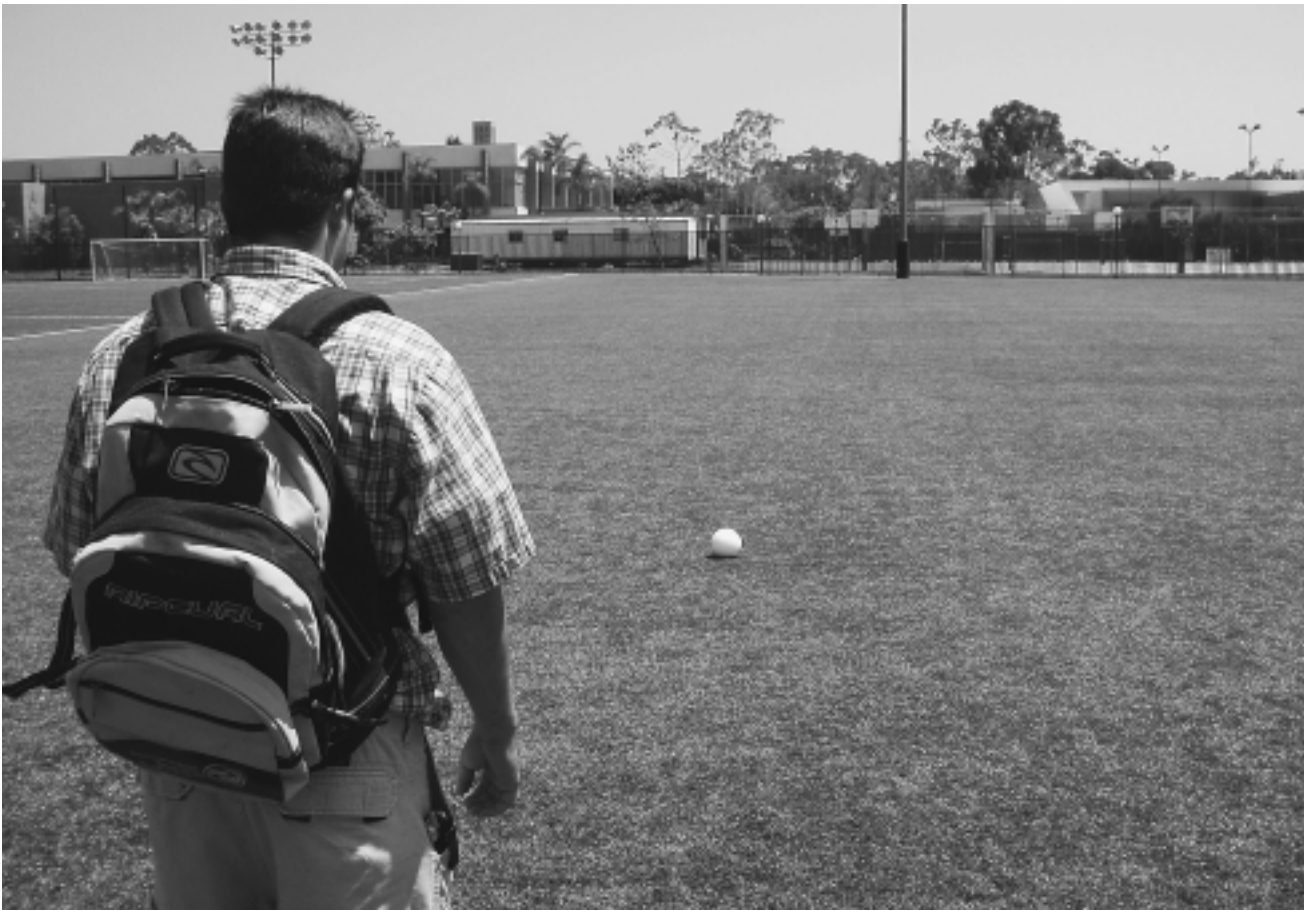
Figure 1. A participant wearing the backpack while viewing one of the target stimuli in the field of artificial turf.

The participants were 36 undergraduates at the University of California, Santa Barbara. Participants were paid or received credit for an introductory psychology course. All