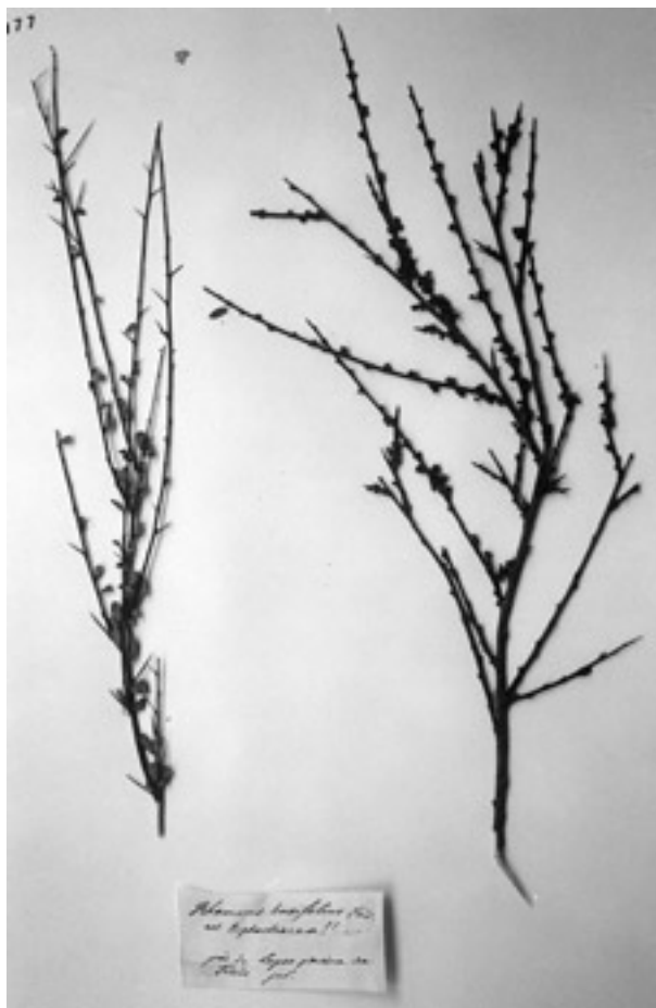
Figure 1.—Actual state of the plants.