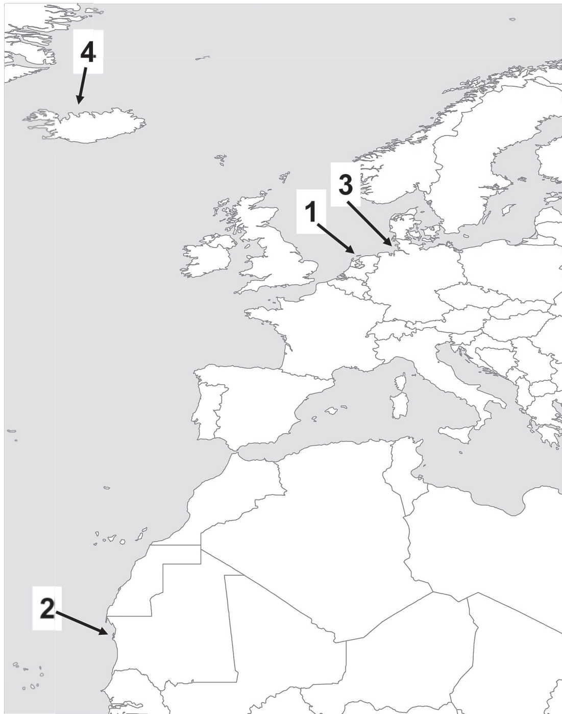
Figure 1. The position of the various ringing and ring-reading locations. 1, Dutch Wadden Sea; 2, Banc d'Arguin, Mauritania; 3, German Wadden Sea, and 4, Iceland. See also Table 3.

colours) and a flag (colour-ring with an extension) on eight different positions (Brochard et al. 2002, Piersma & Spaans 2004, see also www.nioz.nl : and then navigate the site via research, scientific departments, marine ecology and projects to Colour Rings). In this